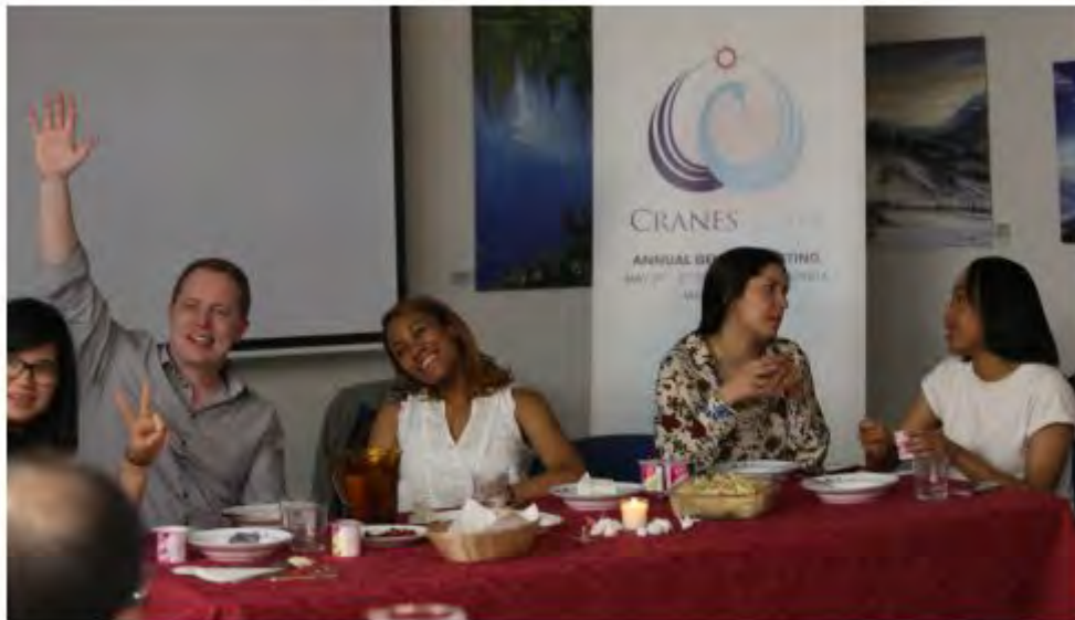
Cranes Club members enjoying fancy diner