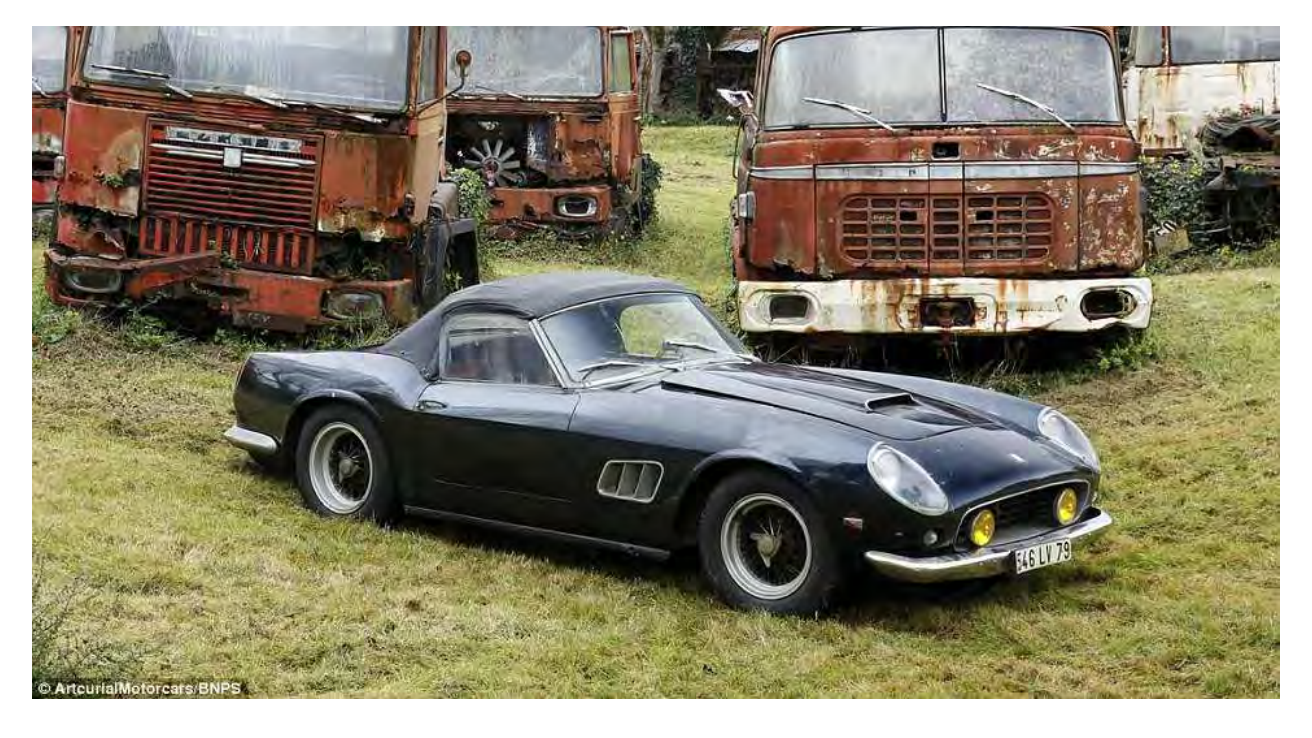
The £12million treasure trove of cars, including this Ferrari 250 GT California SWB, was left languishing on a French farm for 50 years before its discovery