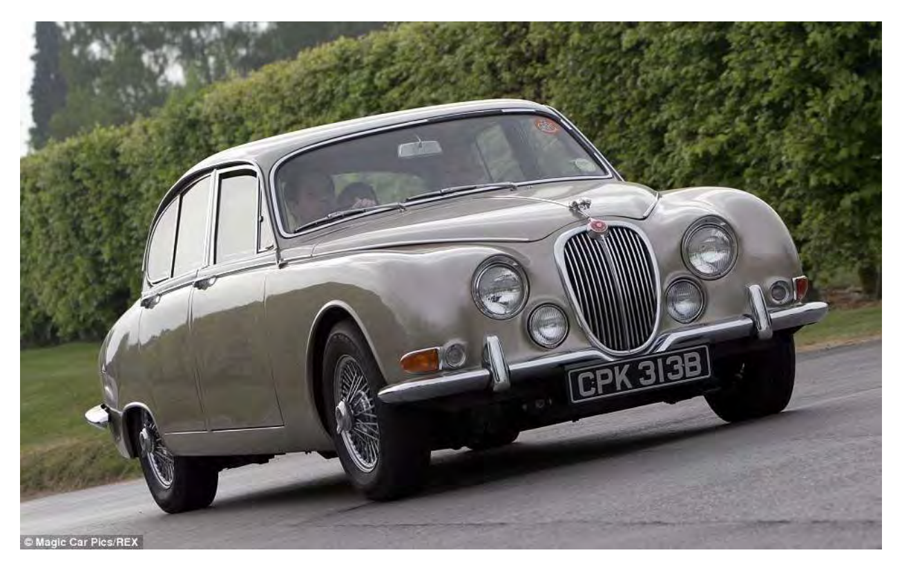
Jaguar type S 3.4 L: The Mark 2 was introduced in 1959 and sold throughout most of the 1960s