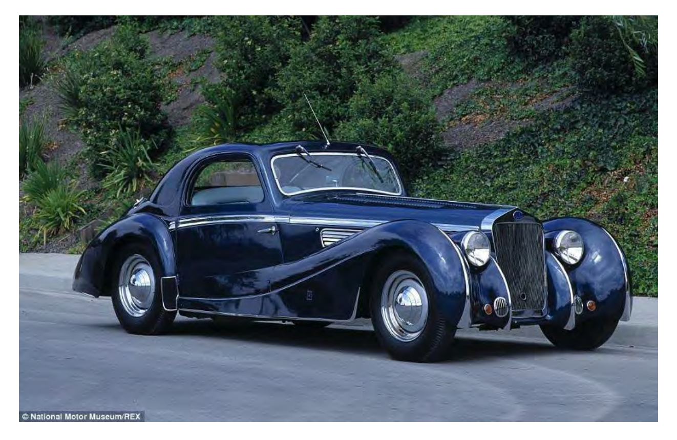
Delage D8 Coupe: The Parisian manufacturers fitted different elegant bodies over the period of years that the car was produced

Ferrari 400: Released in 1976, it could reach 0-60 in 7.1 seconds.