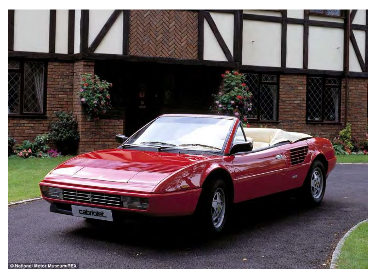
Ferrari Mondial 3.2L Cabriolet: This is the only production mid-engined car with four seats that is fully convertible

Talbot Lago T26 Cabriolet Saoutchik: The smaller cabriolet version was produced from 1946-1955.