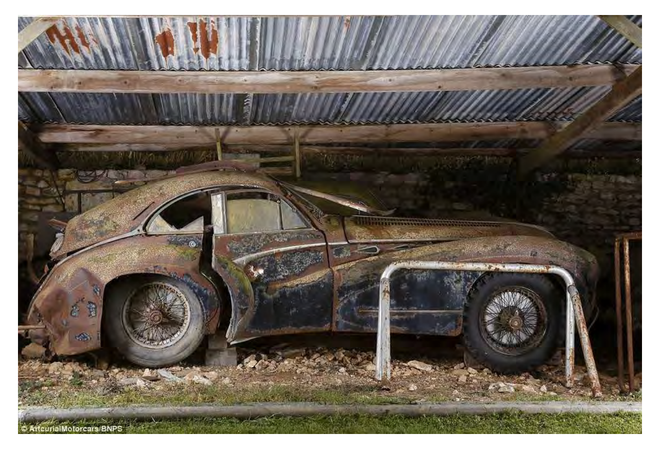
King\ Farouk\ was\ known\ for\ his\ extravagant\ lifestyle,\ which\ included\ owning\ dozens\ of\ expensive\ cars\ such\ as\ the\ Talbot-Lago