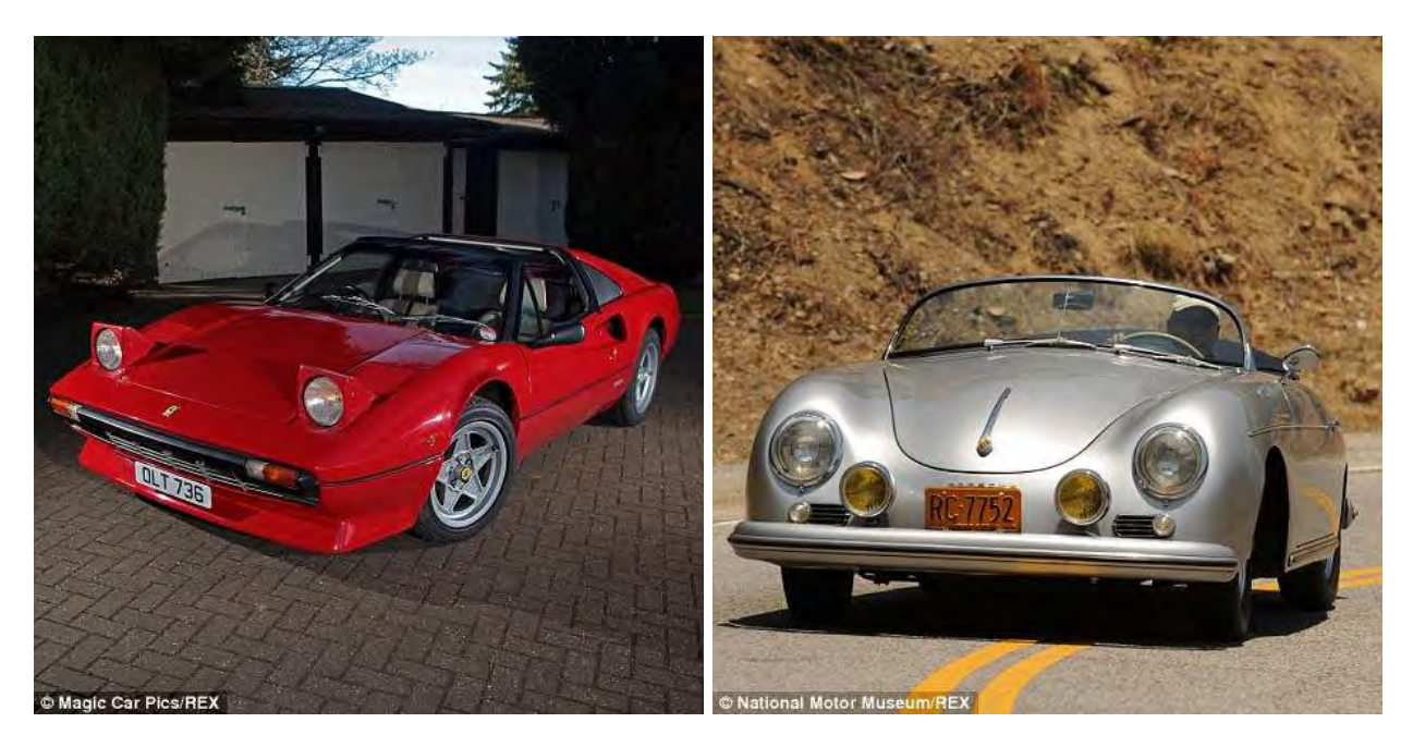
Ferrari 308 GTS: The mid-engined sports car was manufactured by from 1975 to 1985. Right, Porsche 356 SC ex-Sonauto: The German company's first production car

Citroën Trèfle: The three-seat model has room for a single passenger in the rear.