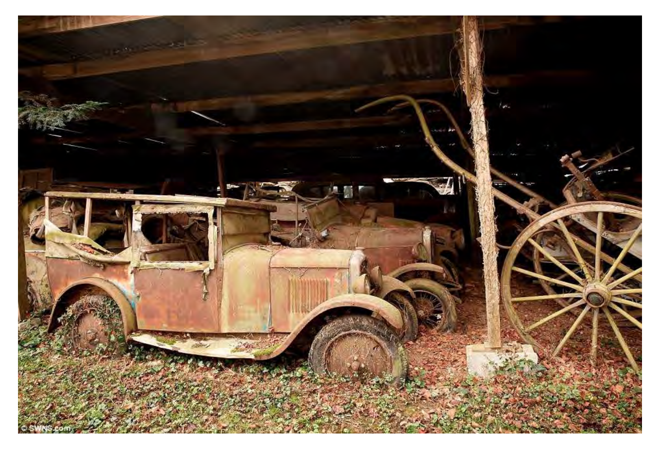
The collection will be sold by Artcurial Motorcars in Paris on February 6 next year, with hopes of raising more than \pounds 12 million