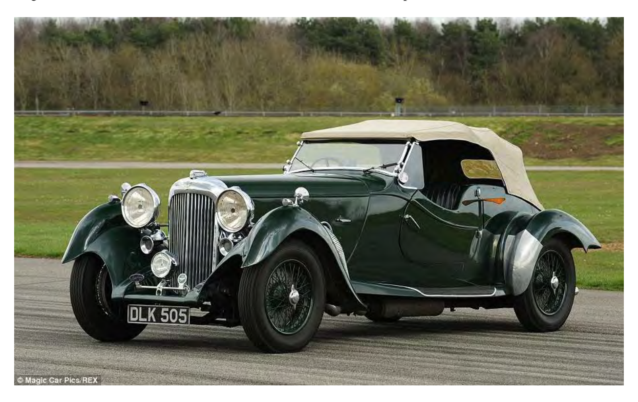
Lagonda LG45 Cabriolet: Models of this wonderful car in perfect condition can sell for up to £140,000