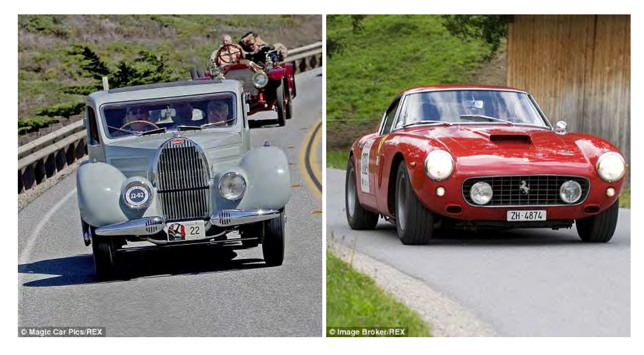
Bugatti 57 Ventoux: Same model sold for £324,800 at auction in September. Right, Ferrari 308 GTS: The mid-engined sports car was manufactured by from 1975 to 1985

Ferrari 308 GTS: The mid-engined sports car was manufactured by from 1975 to 1985.