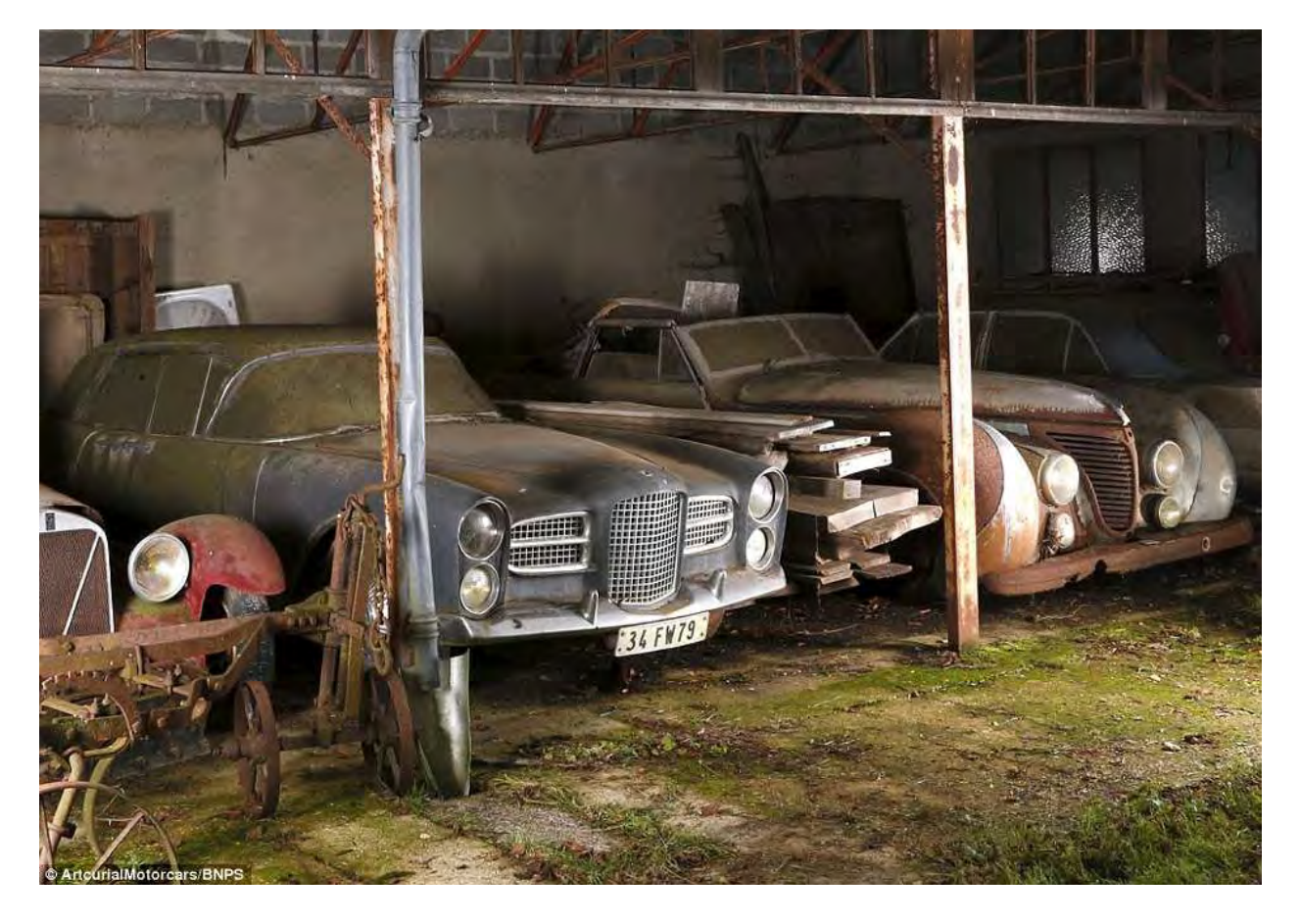
The collection has sat dormant in makeshift corrugated iron shelters and outbuildings on the farm since the 1970s. Pictured: Facel Vega (left) and a Talbot-Lago (right)