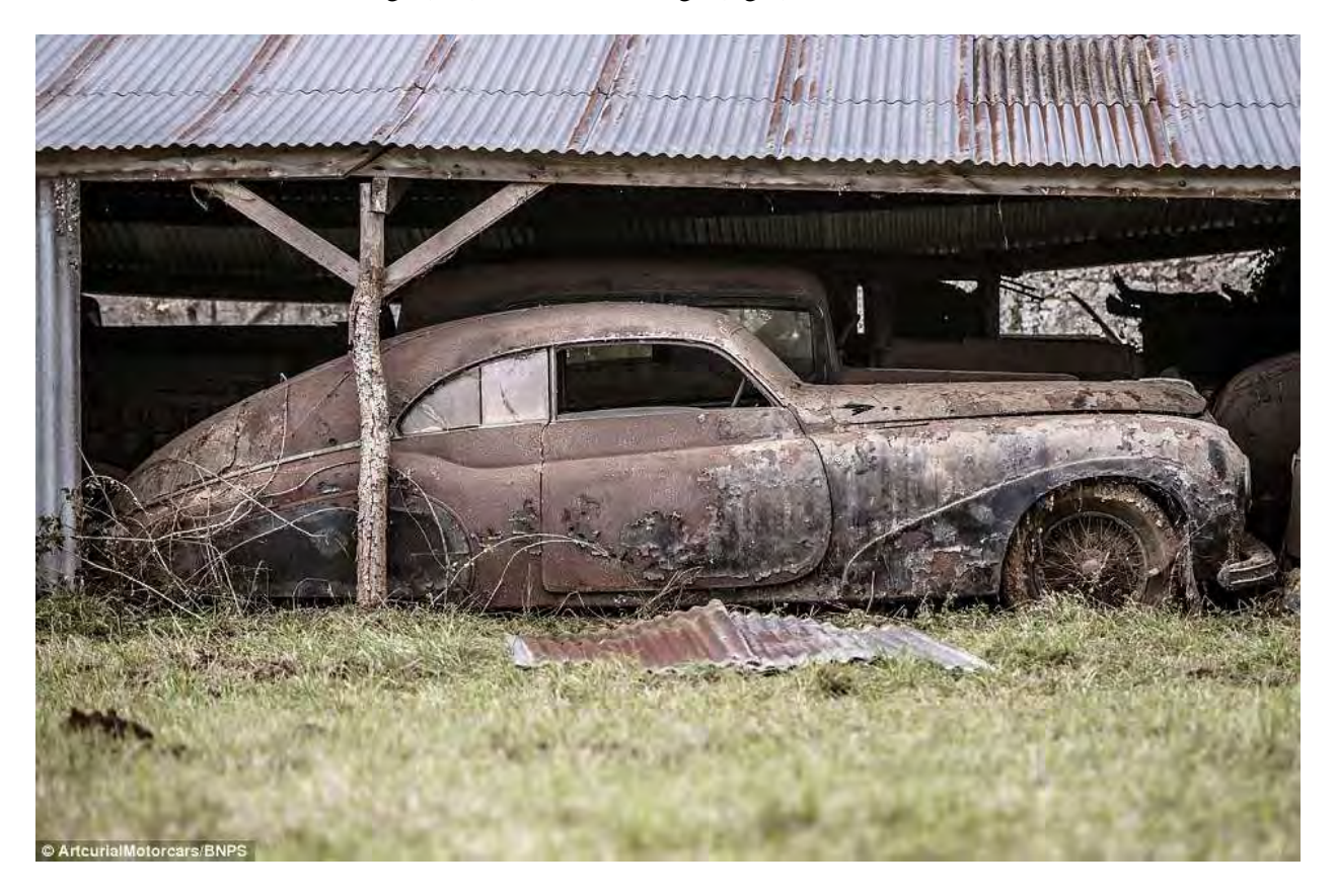
Some of the vehicles may be too rusted to be restored, but many of the cars are worth hundreds of thousands of pounds