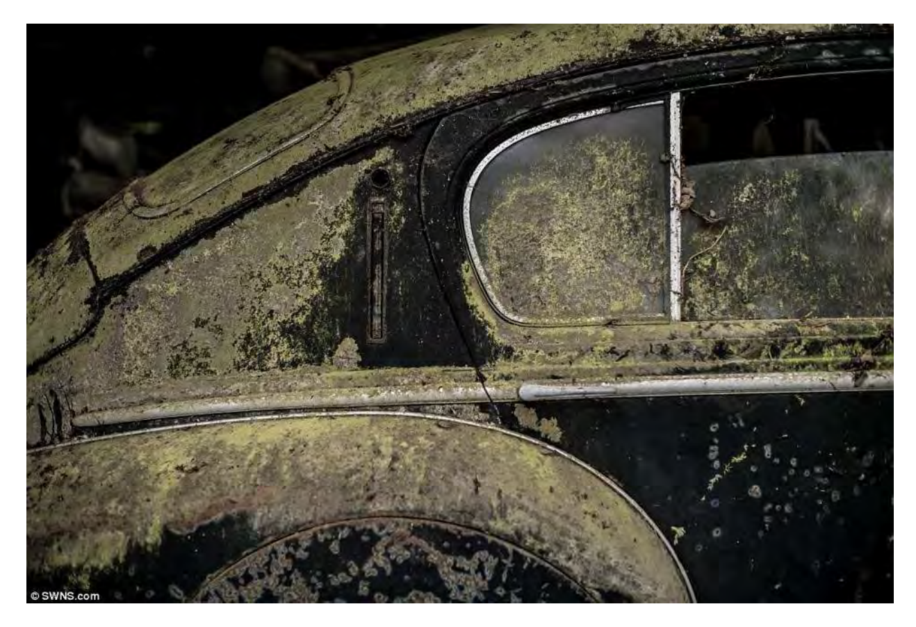
While many of the vehicles are rusty and covered in moss, they could still be worth £500,000 each on average