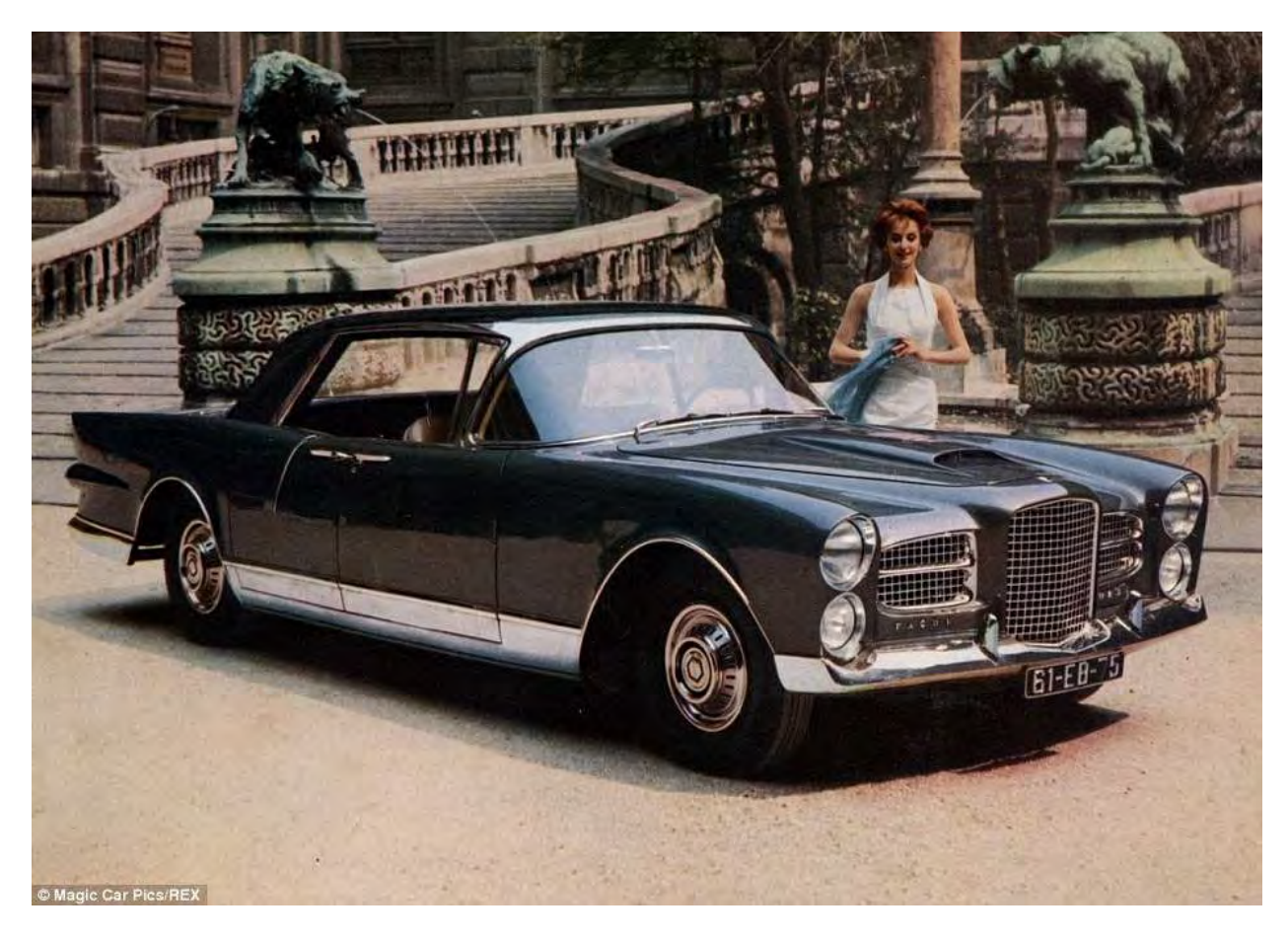
Facel Vega Excellence: This Luxury saloon car was unveiled at the Paris Auto Show in 1956 and was met with rave reviews