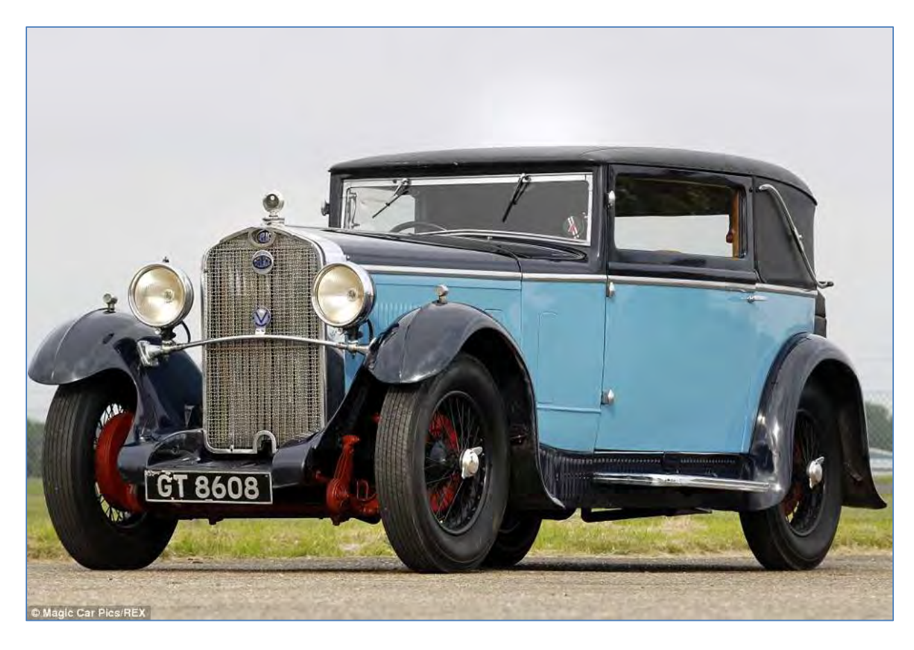
Delage D6: The six cylinder car pictured was produced both before and after the Second World War