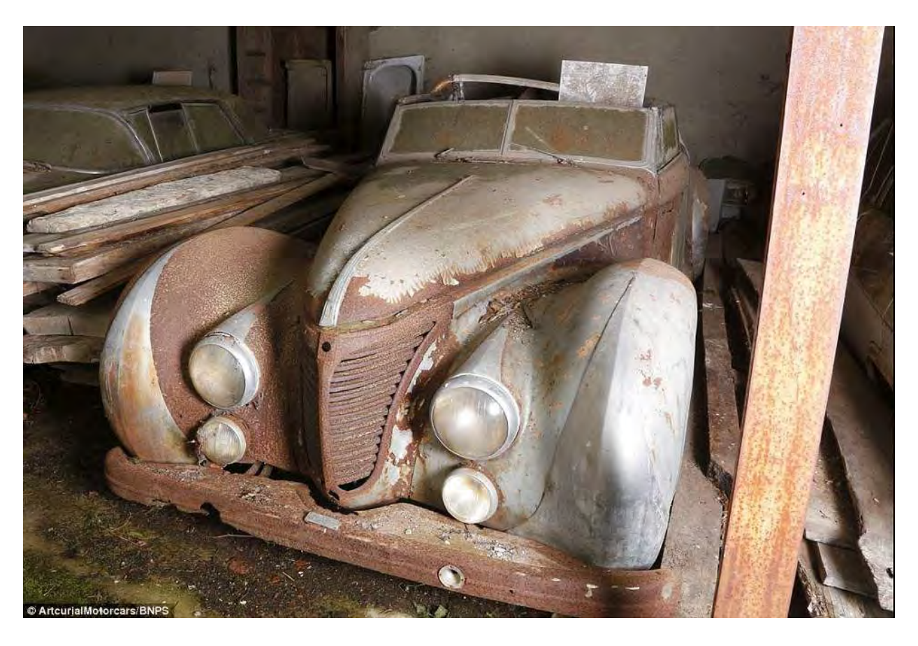
A Talbot-Lago T26 Cabriolet owned by Egyptian King Farouk is also among the vast haul of classic cars found on the farm