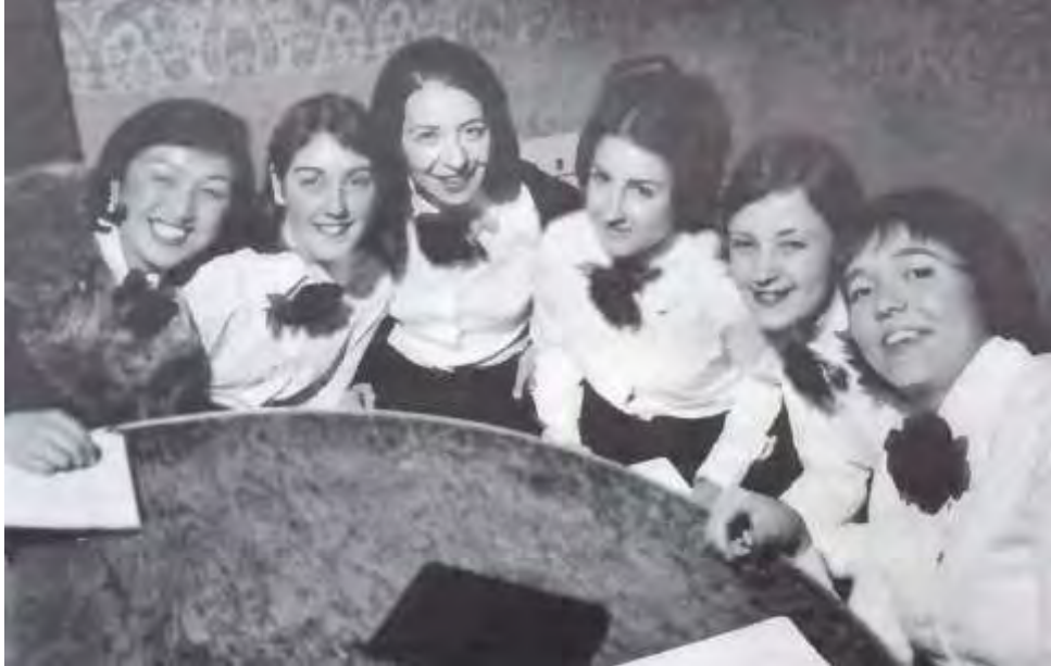
As the Day of Hope tour ended, the New Hope Singers International looked forward to the new potentials of the Celebration of Life program