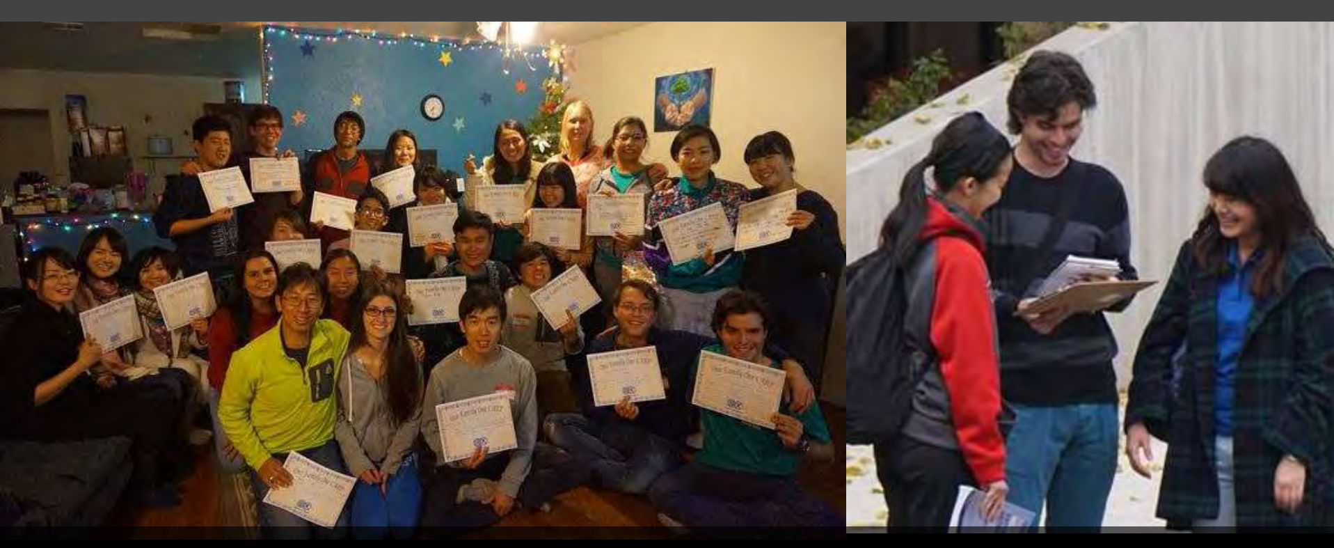
CARP Costa Rica visits Las Vegas