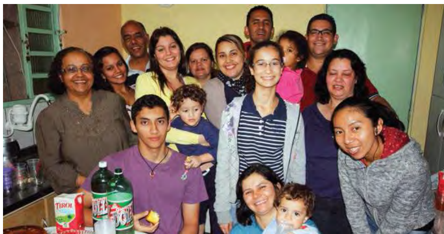
Members of the Itapecerica home group

Members widely report that through home groups, their hope to get spiritual children and fulfill their missions as heavenly tribal messiahs is increasing. They are growing individually through the weekly goal, improving their interfamily relationships and relationships among the brothers and sisters in our church.