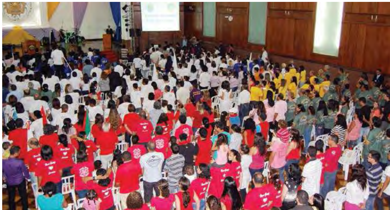
A Home Group Assembly in Brazil at the South American regional headquarters

Using the weekly goal, the members are constantly seeking individual perfection through eliminating characteristics of fallen nature, developing true love, having experiences with God and undergoing internal healing. They practice the precept, "When I change myself, my partner will also change," through which a couple's relationship improves.