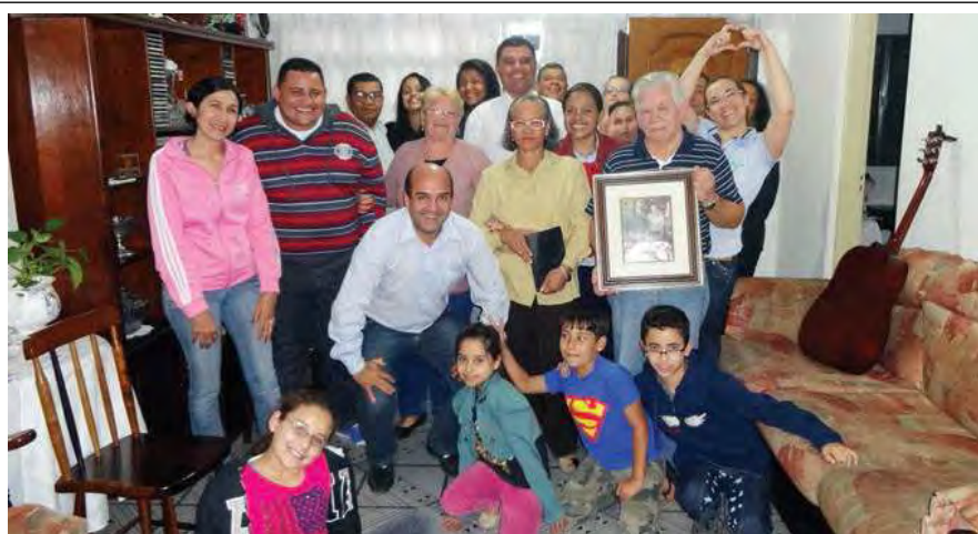
Members become close through one-on-one education in their home groups.

Today, members continually visit the church. They look to the missionary for advice about their lives and are more involved in church-related issues. This resulted from the missionary visiting families on a near daily basis when home groups began.