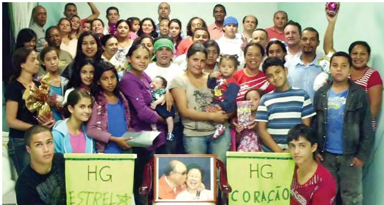
After completing a home group workshop