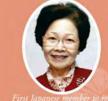
First Japanese member to join the Movement (September 1960)