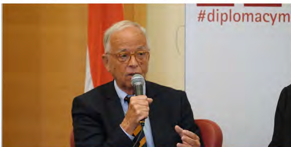
Dr. Werner Fasslabend, president of the Austrian Institute for European and Security Policy