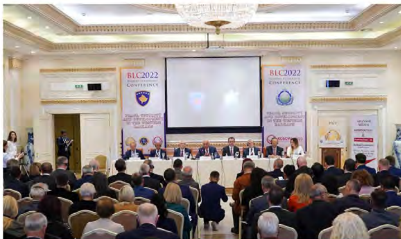
The panel and audience of the opening plenary session

The discussion focused on destabilizing trends in the Western Balkans in the context of the Ukraine conflict, outlining the role of Serbia and the influence of Russia. While these trends also affect North Macedonia, Bosnia-Herzegovina and Montenegro, it is the unresolved issue of Kosovo's recognition by Serbia that generates most of the tension in the region. As a representative of the Albanian people, who are the large majority in Kosovo and form strong minorities in North Macedonia and Montenegro, President Moisiu denounced the historical oppression of his people and highlighted the importance of Kosovo's independence for peace in the Balkans.