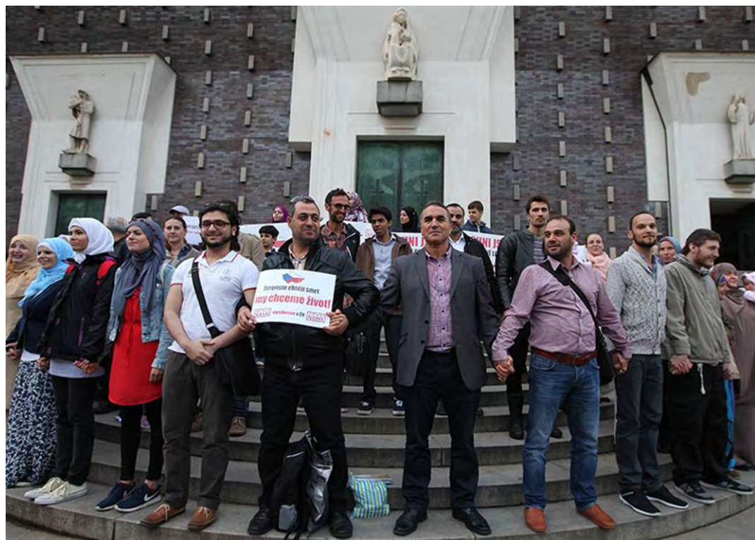
The chain was made by muslims in front of church to protect Christian values.