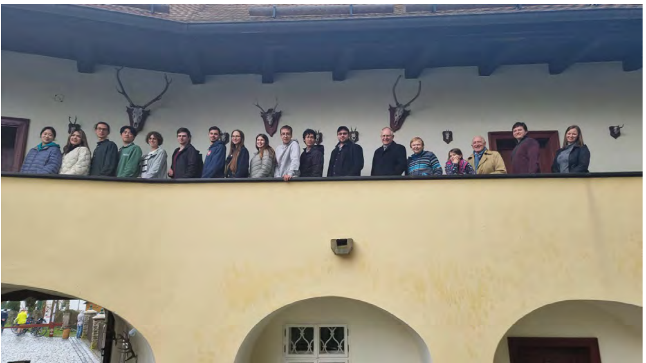
Youth TOP participants standing at the exact same spot on 23rd April 2023.

- The difference between second and third photo is 50 years -