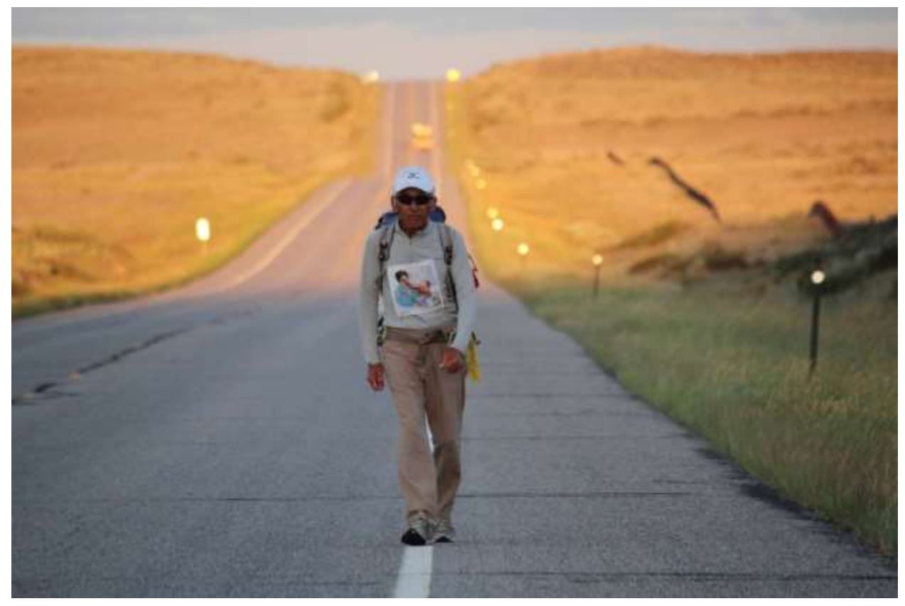
He made his destination earlier than scheduled that day, traveling 39 miles by 8:40 pm. He was supported by God thanks to a strong back wind that gave him more speed. He also found a new shoe on the side of