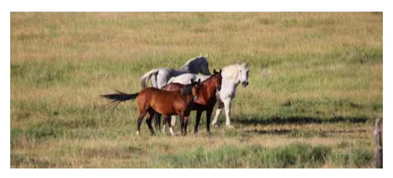
On July 27, Day 33, Mr. Machida walked 10 miles west from Maybell at 5:17 am. The sunrise was an indescribable color of light rising as it covered over Mr. Machida.