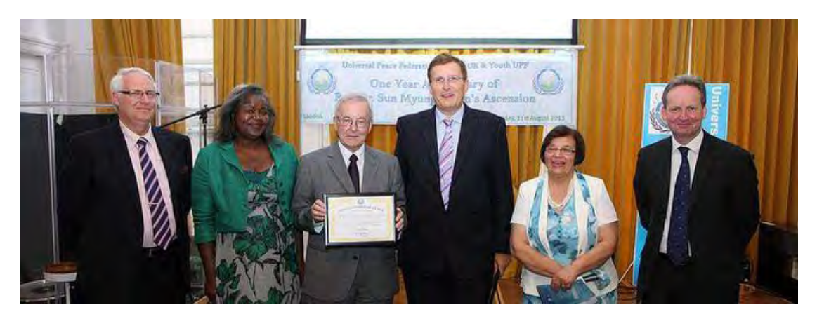
Testimony 2 (2pm – Father Moon's First Anniversary of his ascension event)

Overall, the meeting was a family-like atmosphere. I am looking forward to the Malta trip. It feels like everyone will benefit from this, particularly on social change-related topics and project management skills. I also cannot wait to meet participants from other parts of the world. Amazing what one young organization like YouthUPF can do. I am sure the trip will be exciting and beneficial to everyone.