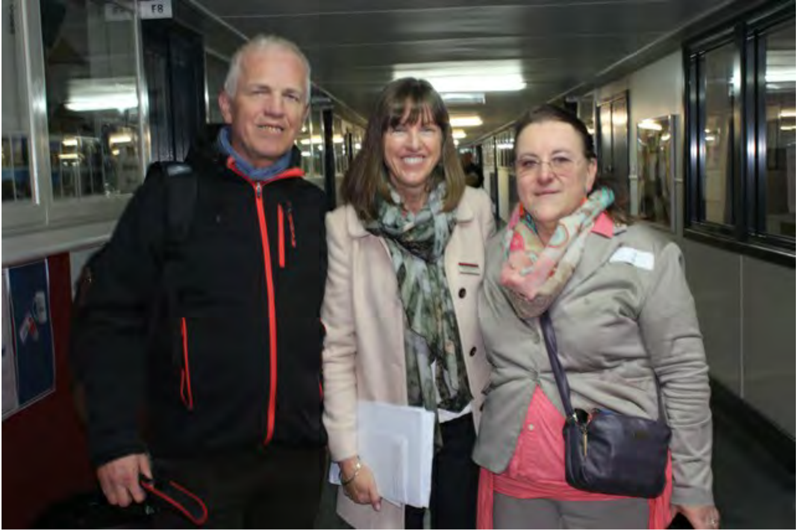
June 12, 2016 in Australia, Blog, Places