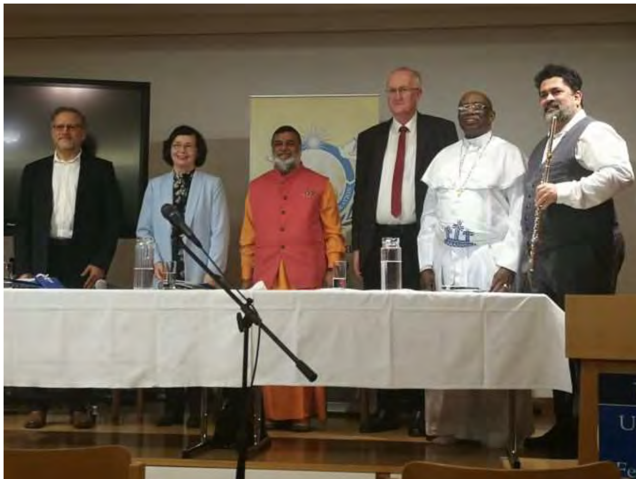
Interfaith Harmony Week event in Vienna