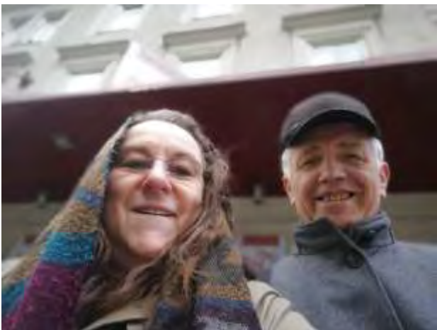
Baby it's cold outside