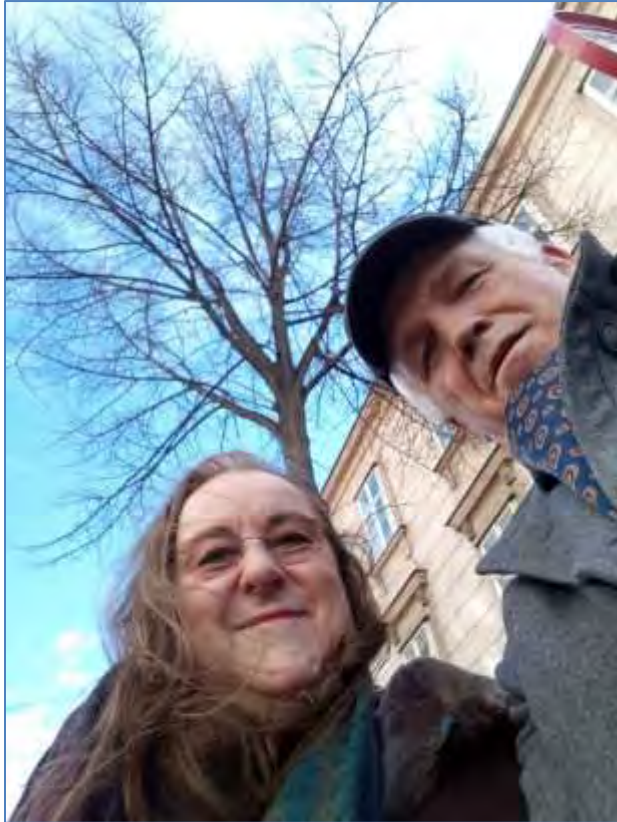
Starting the new year together