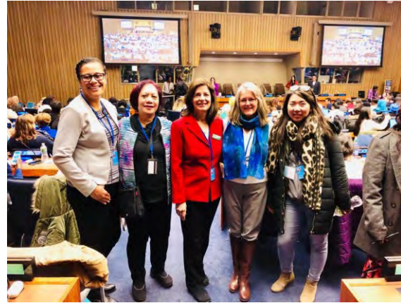
The address was followed by an animated question and answer session between the Secretary General and participants of CSW 63.

attention to dealing with drug trafficking in comparison to dealing with human trafficking. In order to eradicate these horrific incidents of human trafficking, he suggested that more intelligence, more data and more intense efforts are needed to prohibit traffickers from prospering financially and escaping legal retribution.