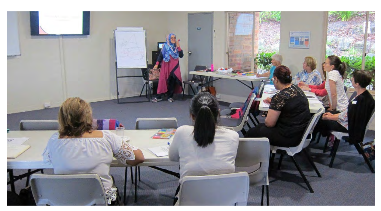
WFWP Women's leadership workshop training Feb 2017