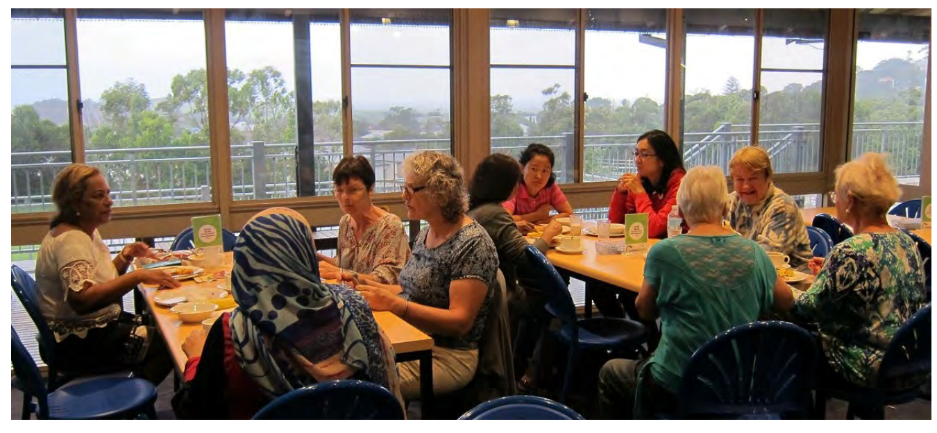
WFWP Women's leadership workshop mealtime sharing Feb 2017