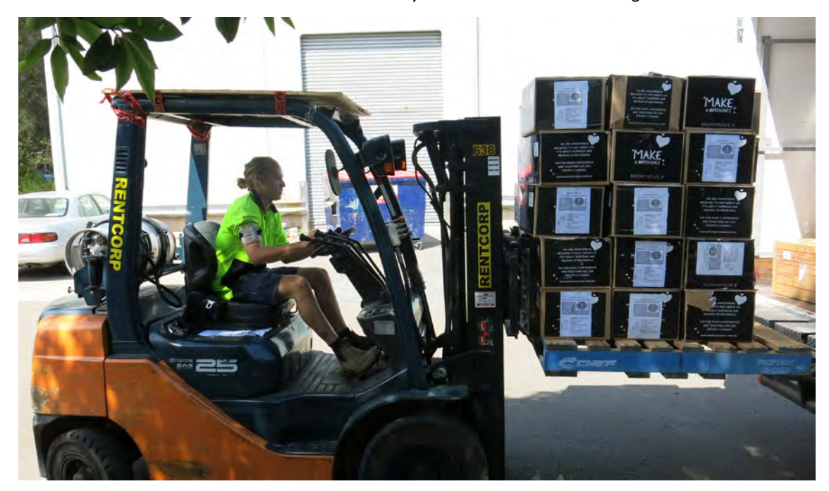
Unloading at the shipping company