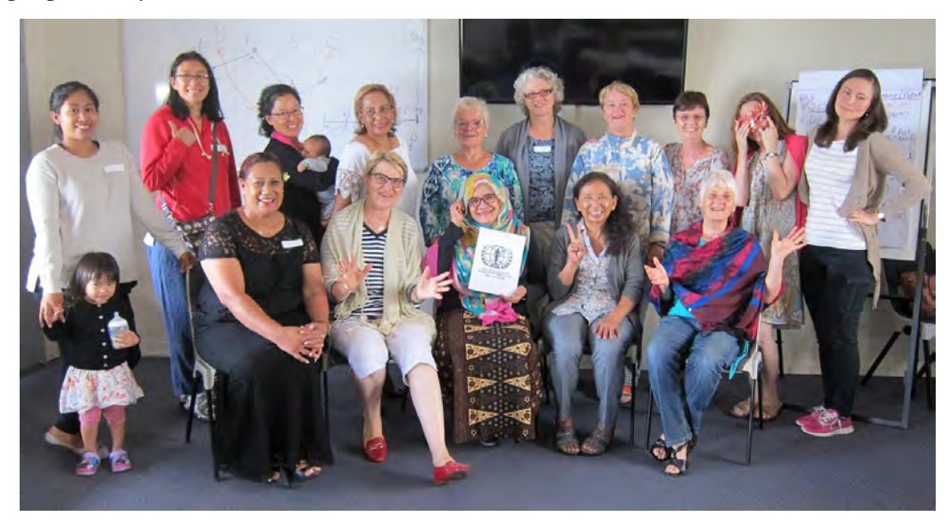
WFWP Women's leadership workshop participants Feb 2017