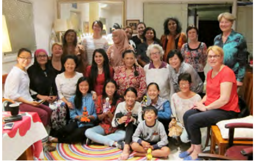
WFWP, Sydney meeting brought together women from 12 different nations.