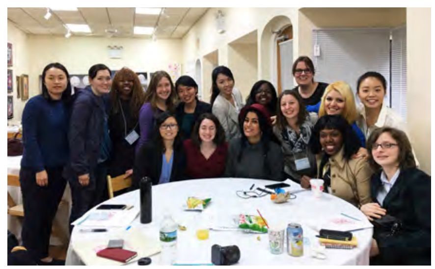
Young WFWP Members from all over the world at the WFWP Young Women Leaders Retreat.

inspirational people all coming together to make this world better.