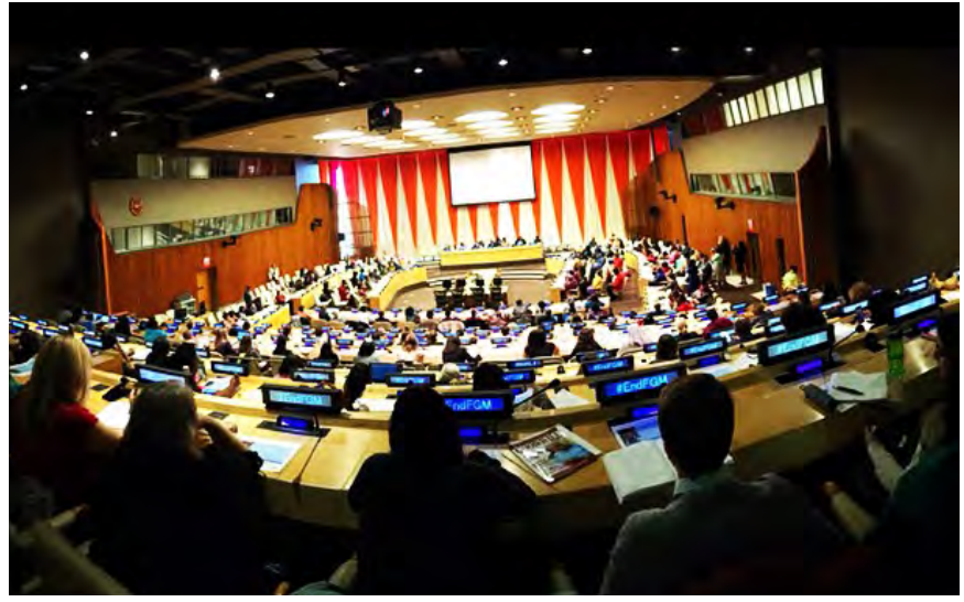
UN session on Ending Female Genital Mutilation.

The NGO CSW 60 forum was a place for activists to speak and learn from each other. Hundreds of women and men stood together passionate about humanity and ending violence against all women and girls. It was inspiring and surreal to be at the UN with so many hopeful and