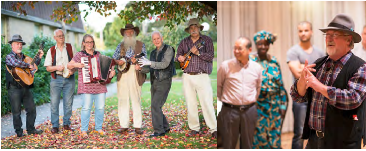
Doopa Doopa Bush Band.