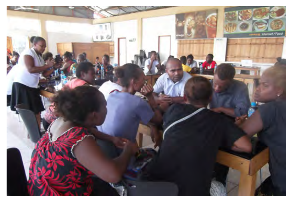
Group discussion and sharing.