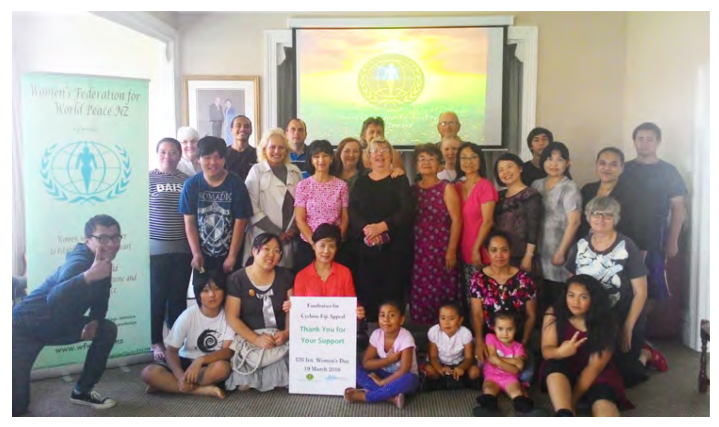
Fundraising - Movie afternoon.

We would like to thank every-one for their generous donation and support.