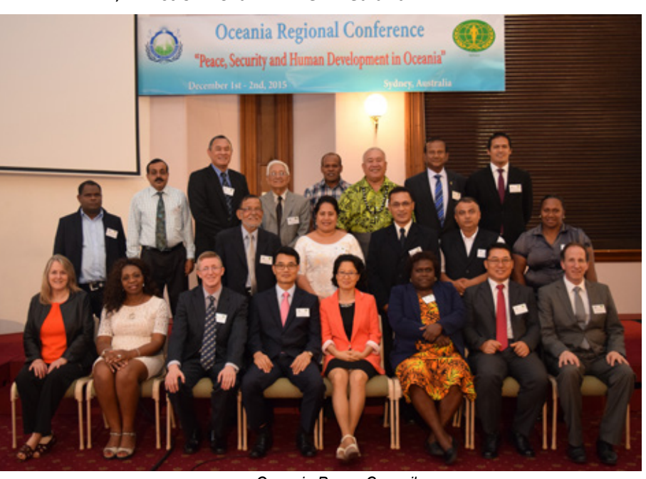
Oceania Peace Council