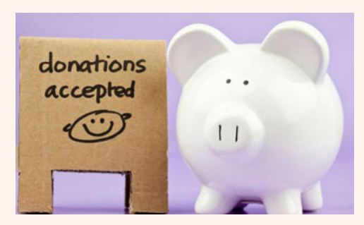
To donate go to WFWP Website www.wfwpaustralia.org

http://www.elainehendrickconsulting.com/