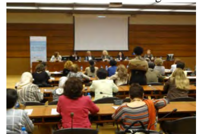
Protection of Children during Conflict: UNICEF : Middle East at UN Geneva WFWP daughters learn ME dance