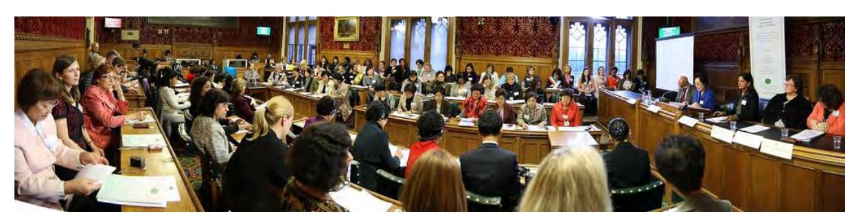
Portugal-WFWP Youth Ambassadors