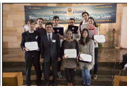
Outing to Venice – plenary session – mini workshop – recipients of the Wonmo Pyeongae Foundation Scholarships More pictures