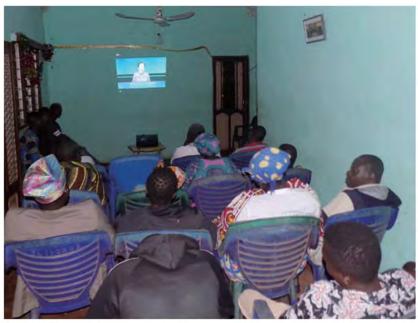
Members of Laurent's tribe gathered in the HTM center at 2:00 AM.

We should be supportive of True Mother's wish to reach out to one-third of the human population by 2027. This aching desire occupies True Mother's mind; it should stir our minds, too. Can the daughter of God focus on anything else, anything smaller? Her position is to embody the divine determination of the Creator, "who desires all people to be saved and to come to the knowledge of the truth." (1 Timothy 2:4).