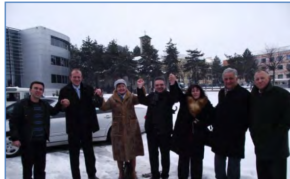
Korça and Tirana ApPs rejoice after the success of the event

We should pass on this beautiful spiritual tradition to Kosovo and Macedonia who have similarities in population structure and UPF and Ambassadors for Peace will give their best to do that.”