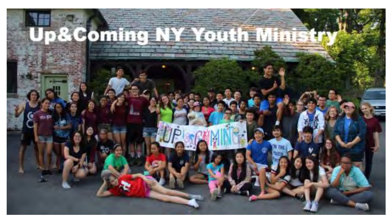
Dear Belvedere Family Community,

Please click <u>here</u> to make a donation and find out more.