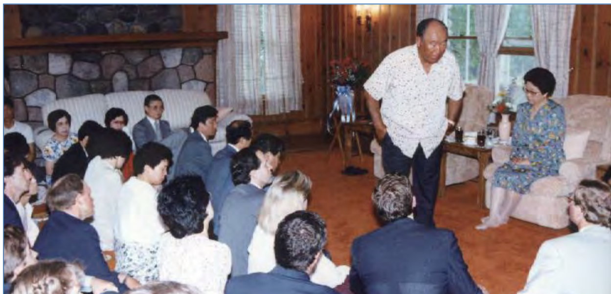
Clearstone Lodge near Cobourg, Ontario, during the time True Parents spent in Canada and Father declared his Gomyeong