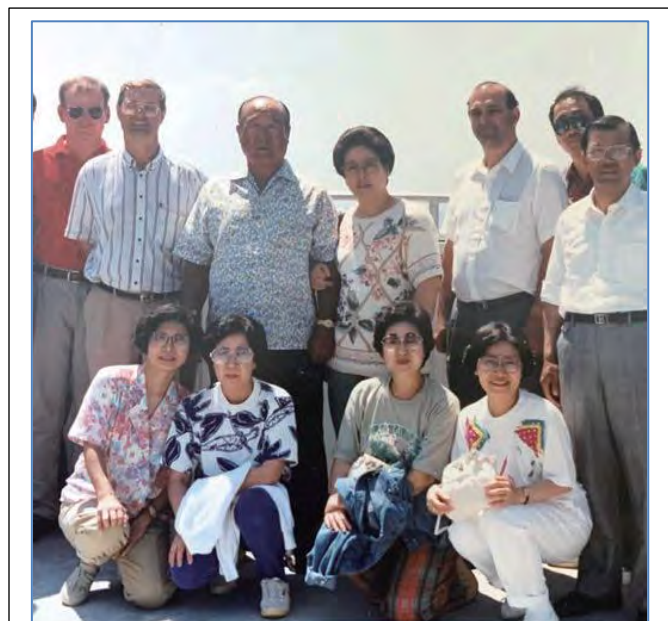
True Parents with Canadian members and the four prominent Japanese woman leaders who were to support True Mother and her mission