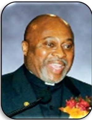
Patriarch George A. Stallings, Jr Imani Temple African American Catholic Congregation Chair, IAPD - USA