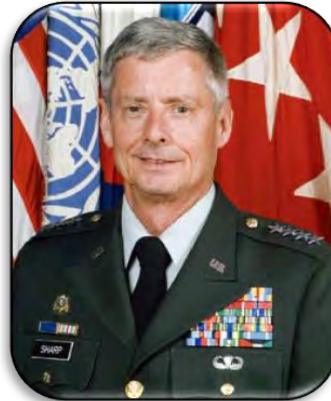
Walter Lawrence Sharp Retired United States Army four-star general. Speech delivered at the Lincoln Memorial on July 27 '23