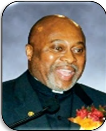
Patriarch George A. Stallings, Jr Imani Temple African American Catholic Congregation Chair, IAPD - USA