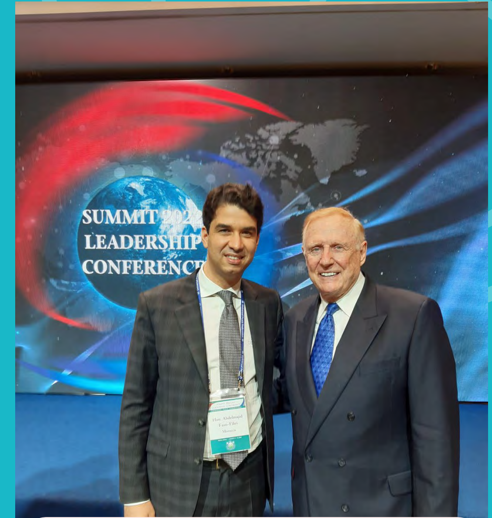
Hon. Abdelmajid Fassi-Fibri (Morocco MP)