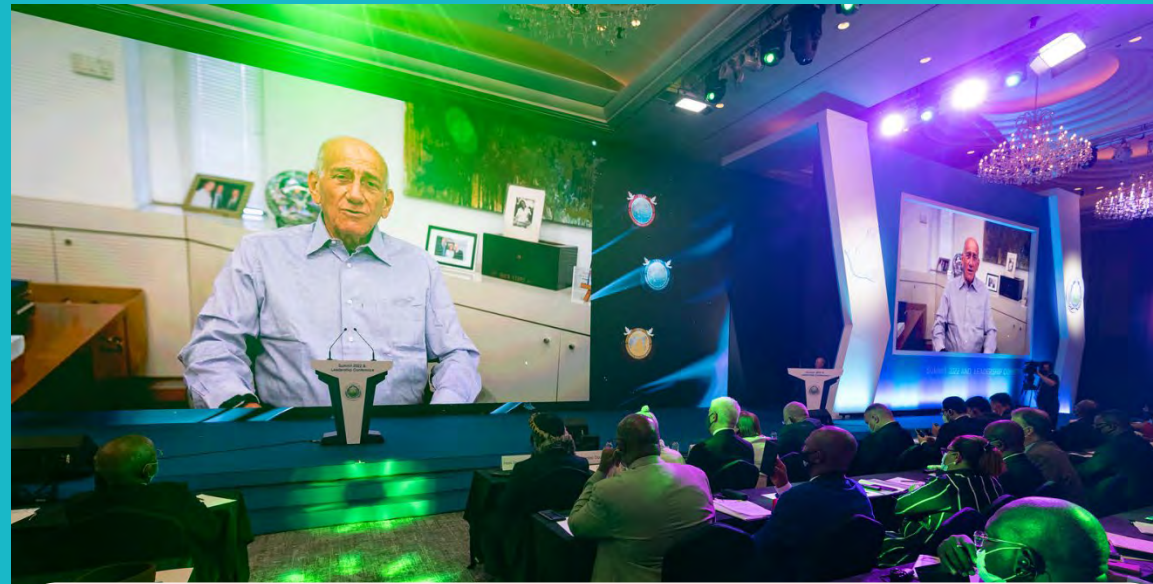
Hon. Ehud Olmert (Israel Prime Minister)