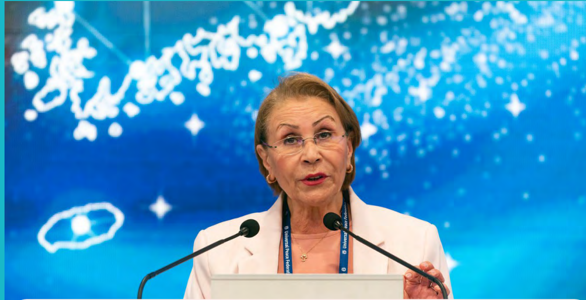
Former Minister for the Family (Tunisia)

Our delegation included two former Member of Parliament, one from Tunisia and one from Morocco with a direct interest in the youth education project being prepared in partnership with CENSAD. We had online message from PM Ehud Olmert of Israel.