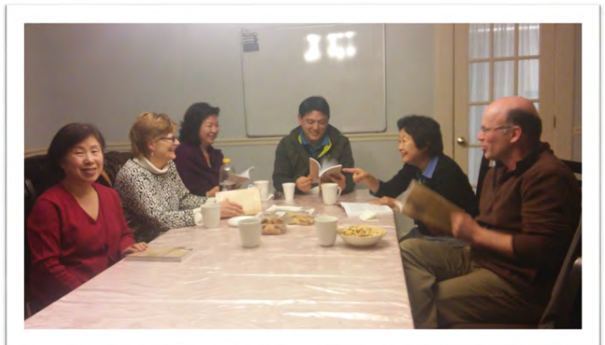
Meeting of Adult Small Group members