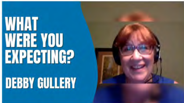
What Were You Expecting? | Debbly Gullery