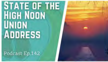
#142 - State of the High Noon Union Address Sep 28, 2022