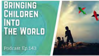
#143 - Bringing Children Into The World Oct 5, 2022