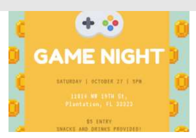
Game Night (Miami, FL) 4th Friday