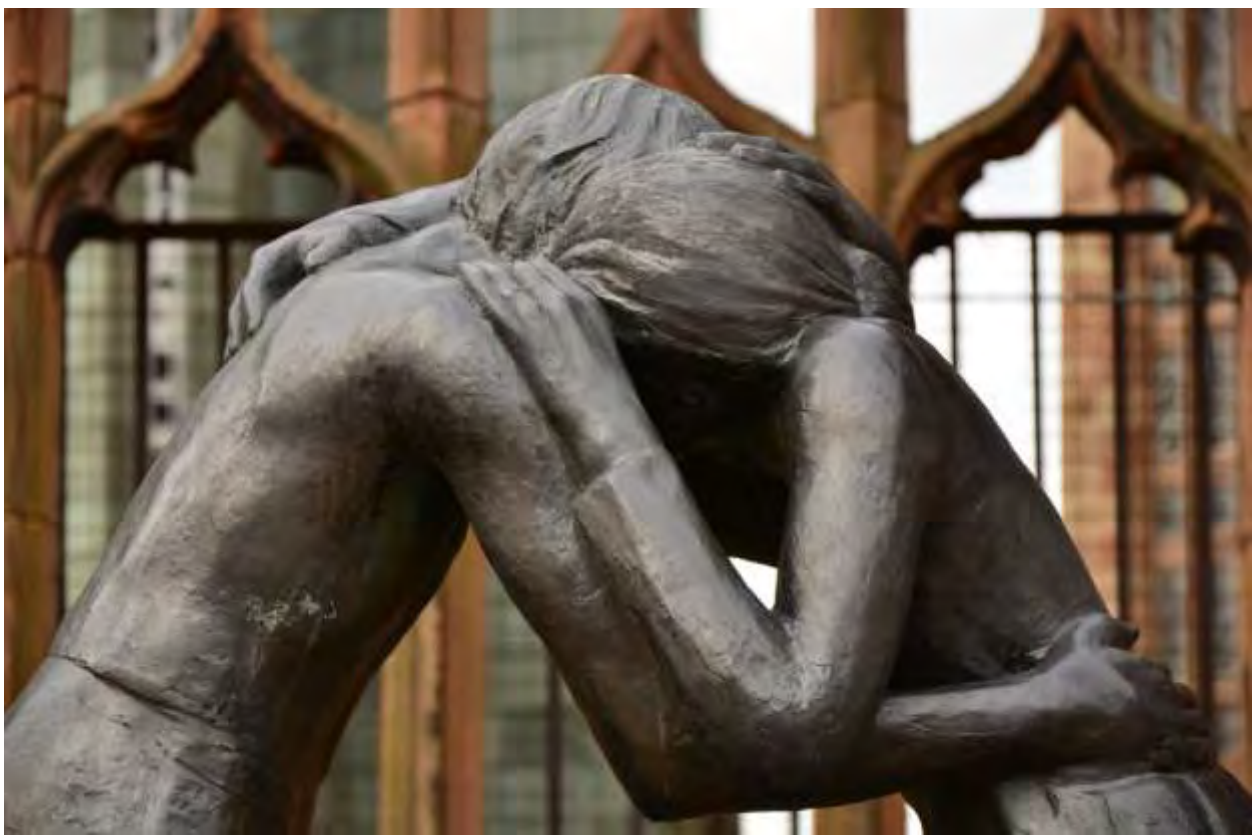
A sculpture of two people embracing with the title "Reconciliation."

What could you forgive? Try to imagine the worst possible incident and imagine if you could find a way to forgive.