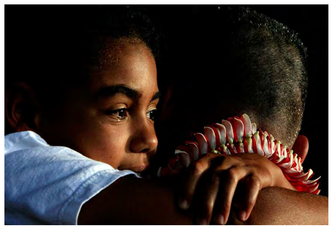
An image of "forgiving."

A couple of CARP students illustrate a time they have forgiven and its effect on them.