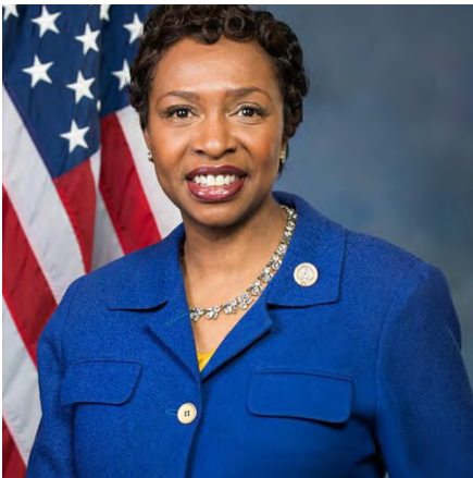
Congresswoman Yvette D. Clarke

As the Representative of the Ninth Congressional District of New York, Congresswoman Clarke has dedicated herself to continuing the legacy of excellence established by the late Honorable Shirley Chisholm, the first Black woman and Caribbean American elected to Congress. Hailing from central Brooklyn, Congresswoman Yvette Diane Clarke feels honored to represent the community that raised her.