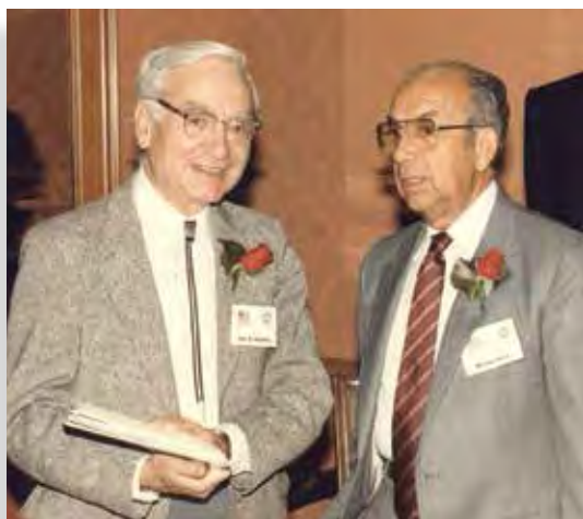
ICUS XIV, Alvin Weinberg and Marcelo Alonso

books and hundreds of refereed papers and articles of new research. In addition to its scholarly strength and substantive contribution to science, ICUS participants also grew to discover themselves as family. Their relationships were meaningful beyond just professional associations. For example, it was common at closing galas that scholars, famous for research and intellectual mastery, not only were treated to world-class cultural performances, but they themselves sang and performed, many with impressive artistic talents of their own.