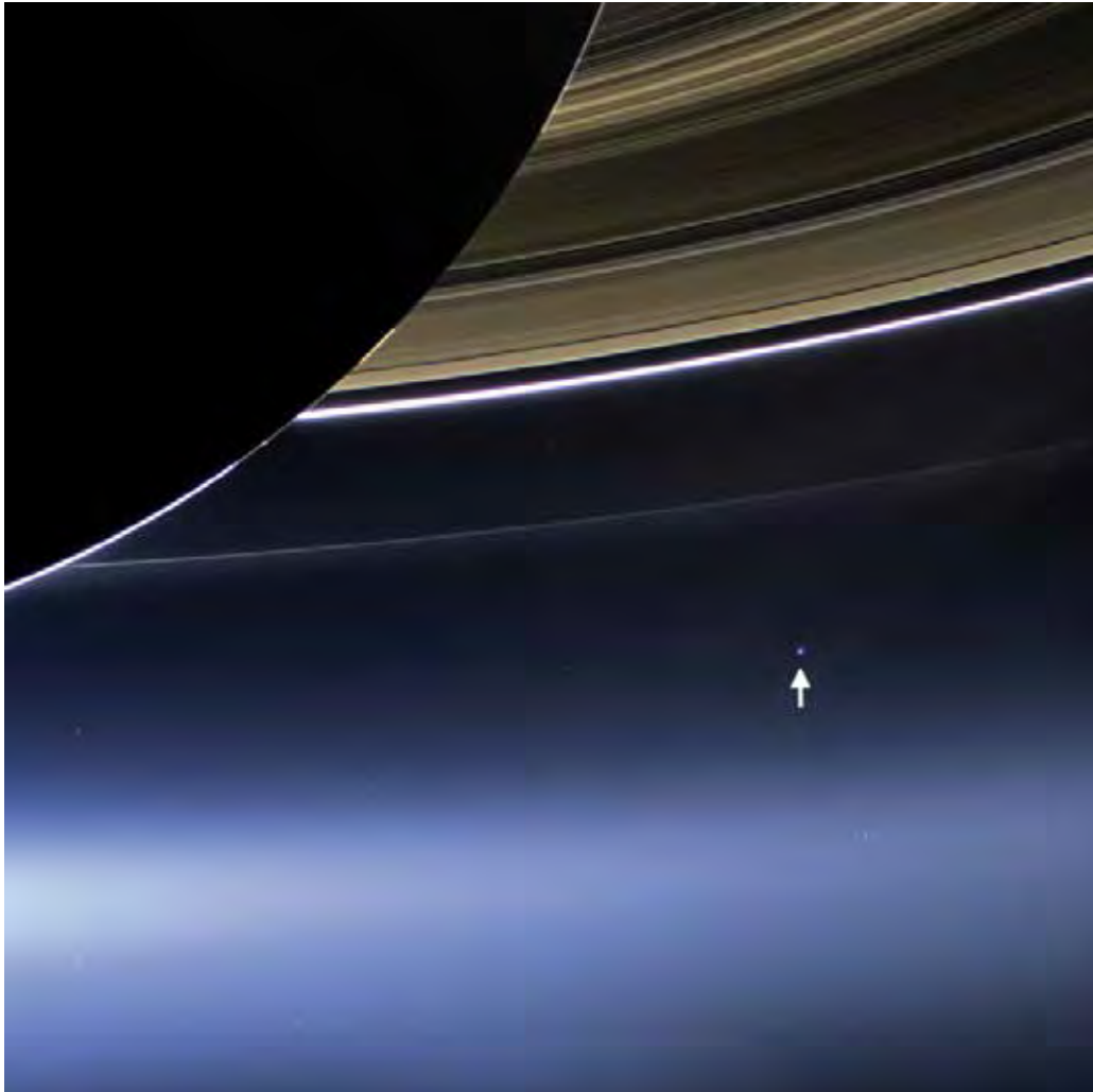
Earth viewed from Saturn, 900 million miles away