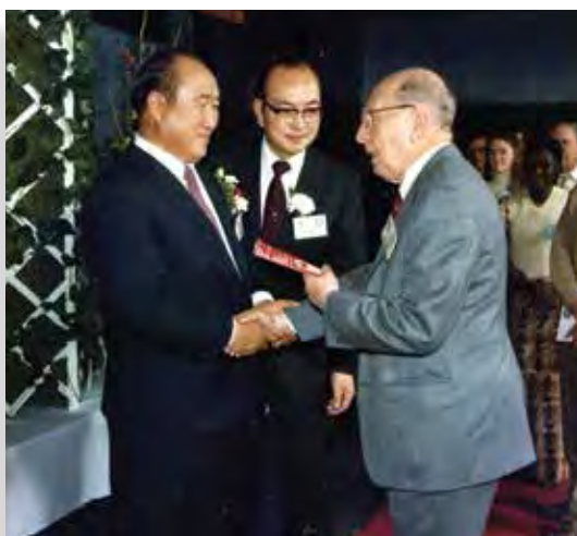
ICUS XIV, Houston, TX. Dr. Sun Myung Moon with Nobel Laureate Eugene Wigner