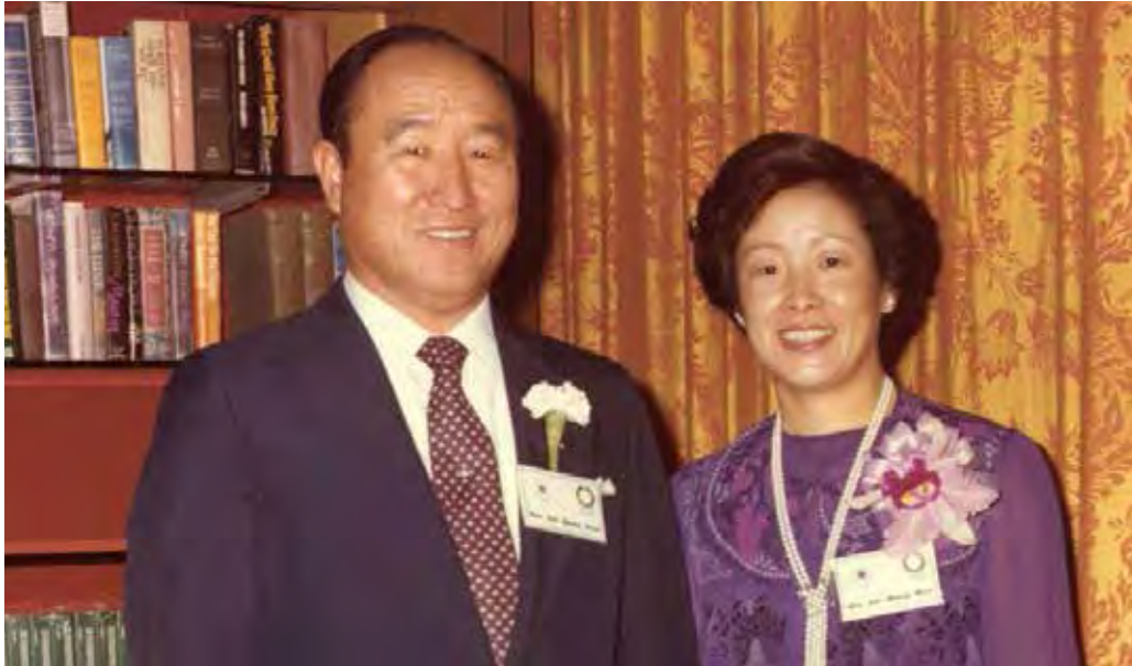
Dr. Sun Myung Moon, and Dr. Hak Ja Han Moon ICUS IV, New York, 1975

D r. Sun Myung Moon and Dr. Hak Ja Han Moon began life together in Holy Marriage in 1960. As a couple they dedicated themselves to living and teaching the way of true families, and working to create a peaceful world. Faithful to their inner, divine call, they came to embody the philosophy of living for the sake of others, realizing their destiny as True Parents of humankind. Living for others defines God's investment at the time of creation, and is also the secret to resolving conflict and ending suffering in the world