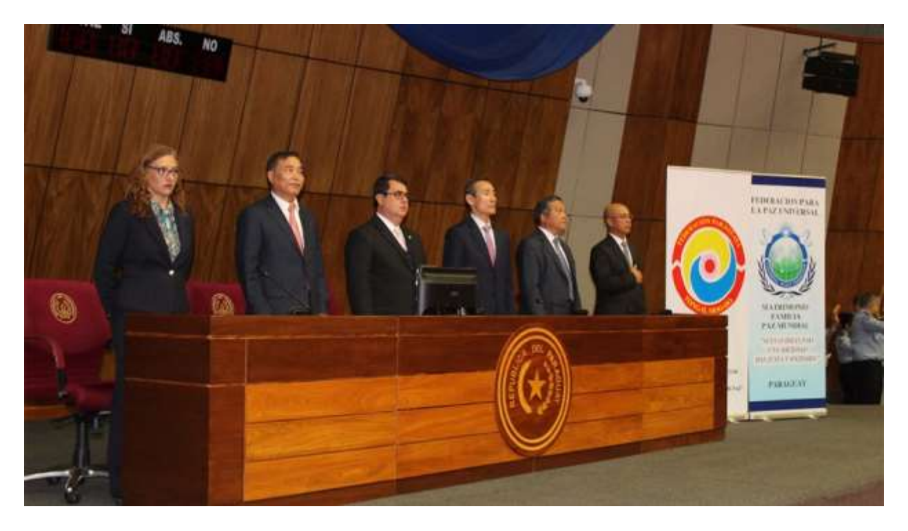
TIMDO is the perfect tool to take young people today along the path of discipline, perseverance and