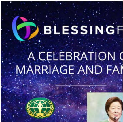
WFWP Watch Party: Blessing Fest