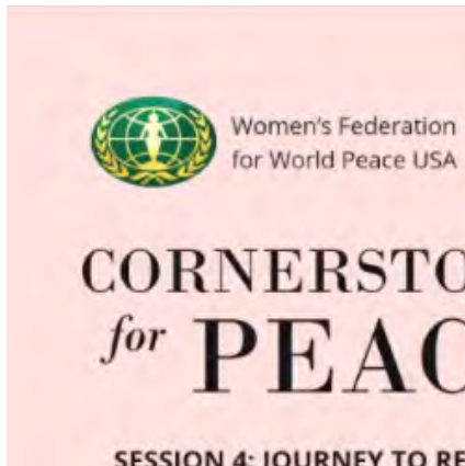
Promoting Marriage: WFWP Canada hosts Cornerstone for Peace Webinars