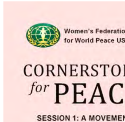
WFWP Canada hosts Cornerstone for Peace Webinar- Session 1