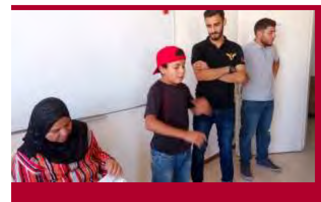
to support his family. He made a determination to start attending literacy classes.