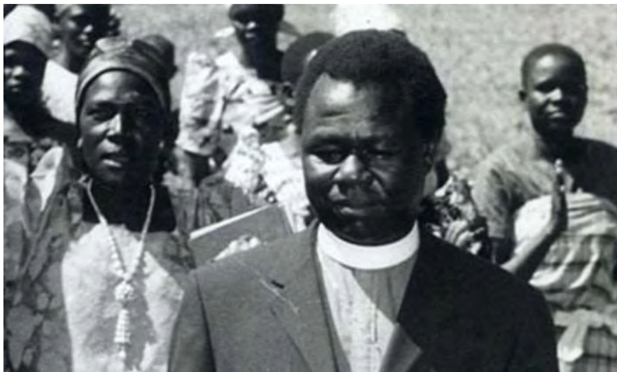
Archbishop Janani Luwum

On August 4 I revisited the Permanent Secretary at Crested Towers; he sent me over to the Chief Education Officer. He told me I needed a form from the Ministry of Internal Affairs. The next day I got a Special Form from the Immigration Board. They then needed a copy of my University Diploma (luckily in our Barrytown Training we were told to bring a copy of any college diplomas we might have. Also another missionary in New York told us that we should keep 80 percent of our money in traveler's checks). I re-contacted the Immigration Board on Aug. 7 and I was, at last, granted a three-month extension on my tourist visa (Uganda was a place to learn patience).