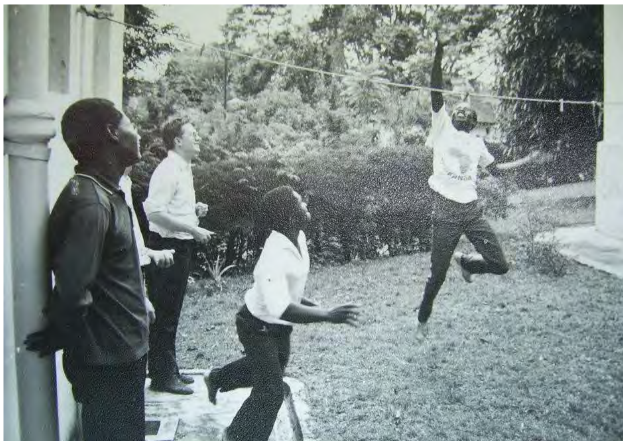
New members in Uganda play volleyball