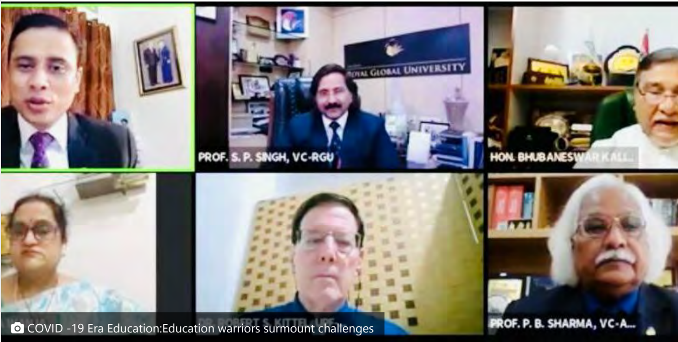
COVID -19 Era Education:Education warriors surmount challenges