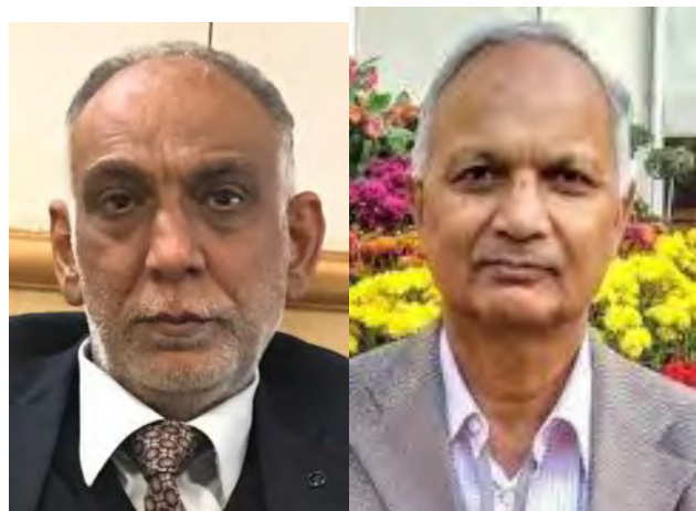
COVID -19 Era Education: Education warriors – Teachers-surmount