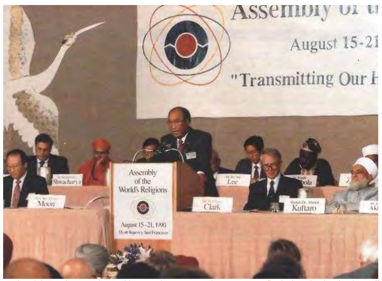
Father delivers the Founder's Address at the Opening Plenary Session flanked on the dais by the staff of the Assembly and its distinguished participants

Then what is the true purpose of religion? What is a correct tradition to bequeath?