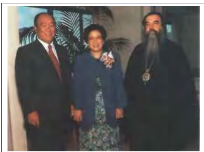
Father and Mother meet with Metropolitan Philaret, the Patriarchal Exarch of Byelorussia