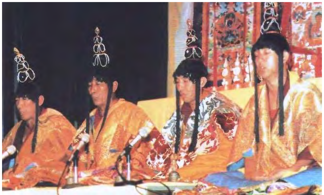
The voices of these four Tibetan Buddhists mingled sonorously, almost hypnotically, through the auditorium on the evening of traditional religious chanting.

the participants from different denominations or sects within the same religion to create a worship service that reflected not just one aspect but the essence of that faith.