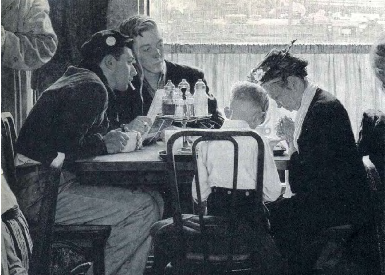
Children full of grandparents love usually don't become delinquents.

The smaller purpose must serve the bigger purpose. Why must the small live for the big? Because the small needs to be bigger. In order for the small to become bigger, the small need to serve the bigger. So all the time we need to talk, think, do, and pray for the church, for the country, and for the world. We should always think about our parents because our parents are bigger than us. Then our children will think of us more than themselves. Then, the later part of our life will be very happy. If we don't serve our parents, our children will not have that example and will not be inclined to serve us. Then when our old age comes, it will be very sorrowful.