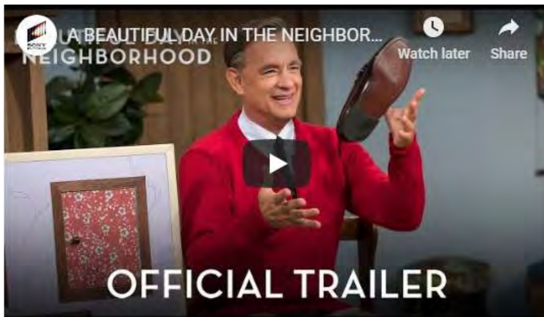
The official trailer for "A Beautiful Day in the Neighborhood".

Roger's Neighborhood in which Rogers introduces the audience to his friend Lloyd Vogel, a journalist who is so sad and unable to forgive. On the other hand, it is about Vogel forced to take on an assignment he feels is a waste of his time while he is in the midst of fighting his own personal demons.