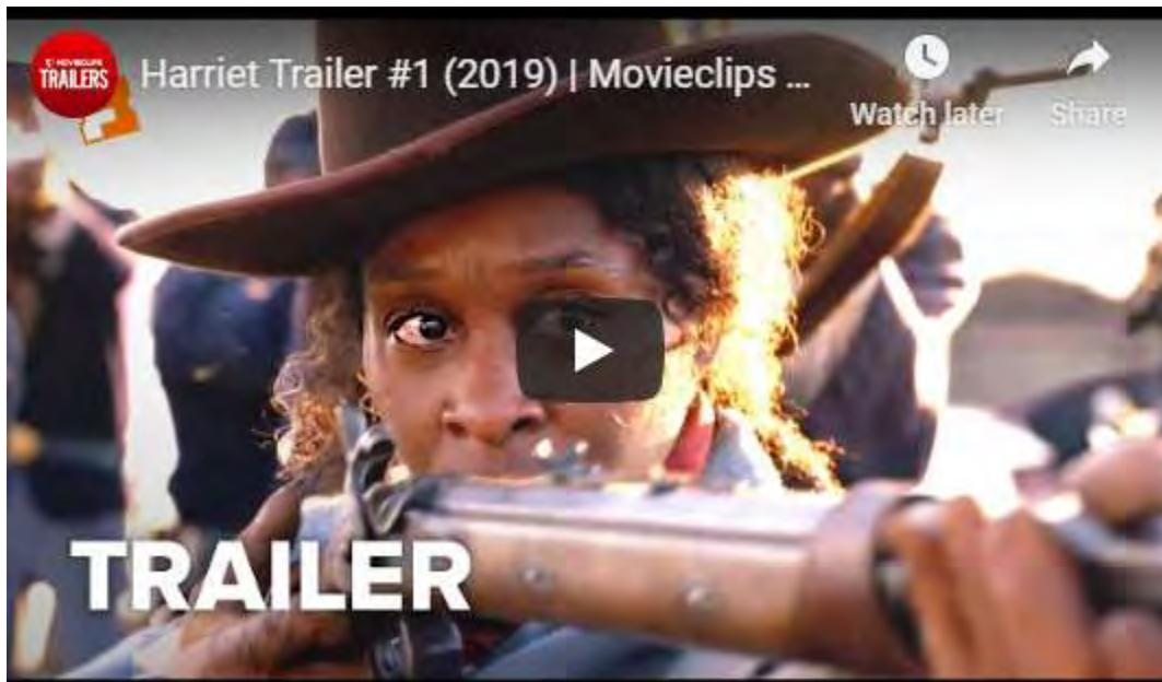
The official trailer for "Harriet".

The film is powerful and engaging. Erivo's memorable performance as Tubman demonstrates why she is nominated for a Best Actress Oscar (as well as for co-writing a Best Original Song nominee, the film's "Stand Up"). What makes this movie stand out from the books written about Tubman is the role of divine guidance in her life. Though Tubman was known as "Moses" among slavers and slaves alike, her ability to hear God's voice during her dangerous trips on the Underground Railroad was often questioned or dismissed as a result of being struck in the head by a slave owner when young or a sign of mental instability. This recurring theme, though, is what adds depth to this telling of Tubman's story.