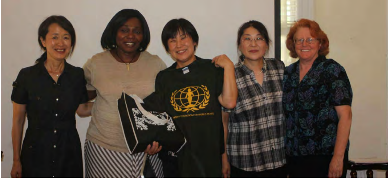
The New Jersey Leadership Team