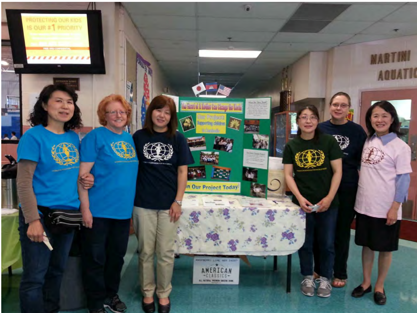
Promoting the Cambodian Foster Parent Project

Are you interested in The Cambodia Foster Parent Project? WFWP New Jersey Chapter will continue to collaborate with WFWP Japan to support the Foster Parent Project in Cambodia.