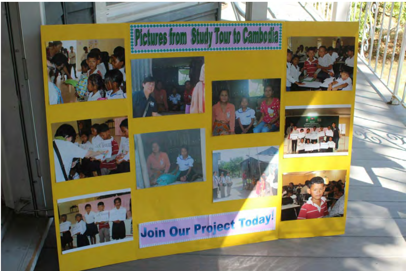
Display Poster for the Cambodia Project