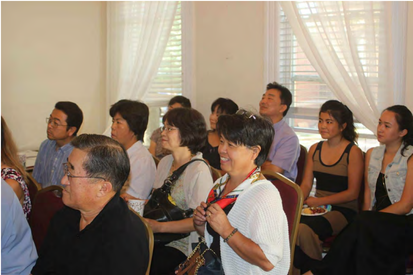
The New Jersey Audience

children they are sponsoring. Cooperation between WFPW Japan and local Cambodian schools and teachers is one of heart and familial engagement which truly embodies the meaning of “it takes a village to raise a child.” Tours are also arranged for foster parents to visit the children at certain times in the year.