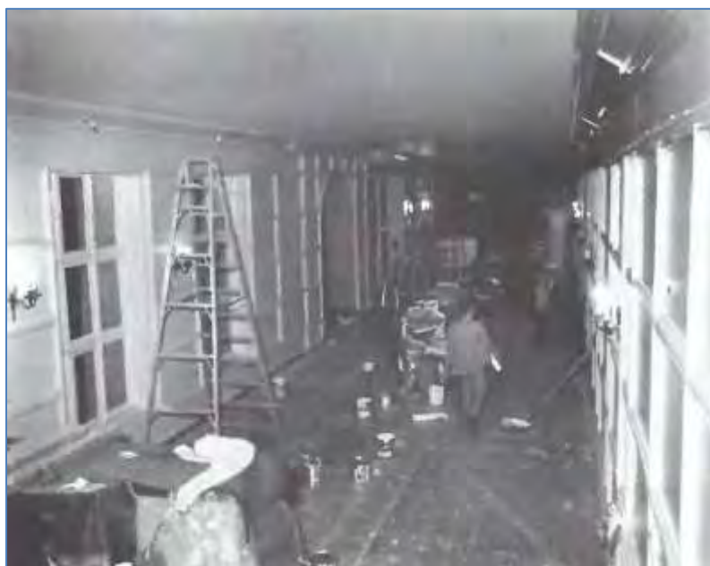
Spacious lobby required 100 man-days to paint

43rd St. as executive manager of the Columbia University Club.