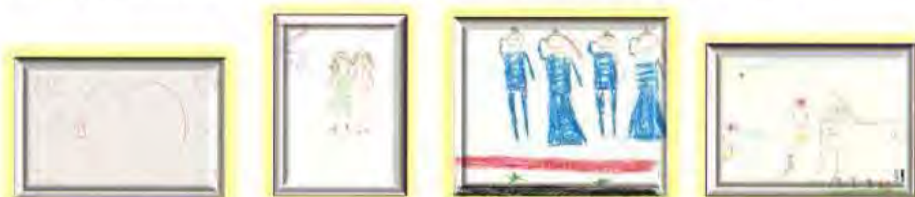
Pictures drawn by Refugee children in the Alte Asfinag Camp Salzburg in February 2016

“Education is everyone’s birth right. I, myself, was born poor, after Korea was devastated by the Korean War. I owe everything I have now to education — a good education — and investment by the Government. I owe it to the world, to the United Nations, to do everything possible to give all people the same start. At that time, the United Nations was a beacon for many Korean children. Now the United Nations is also a beacon for millions and millions of children around the world. We have to help them. A family’s poverty should never deprive any child of a good education. No child should be left out of school because of gender, ethnicity or geography”, UN Secretary General Ban Ki Moon