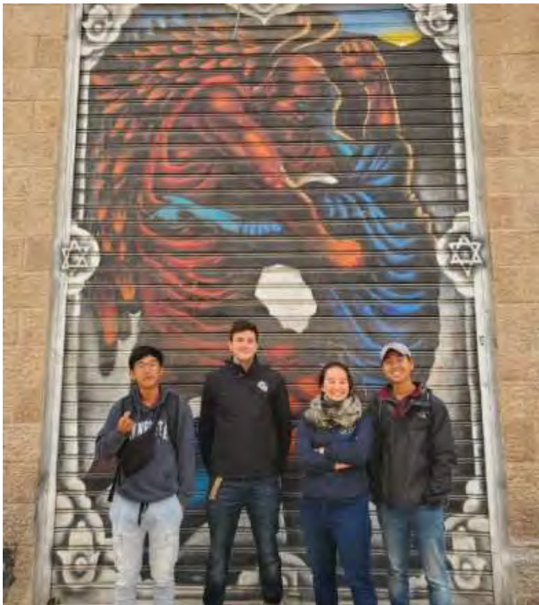
Israel team posing in front of graffiti of our name sake, Jacob wrestling the angel.