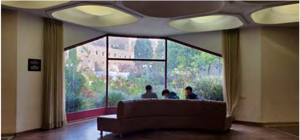
CARP outreach at the Hebrew University