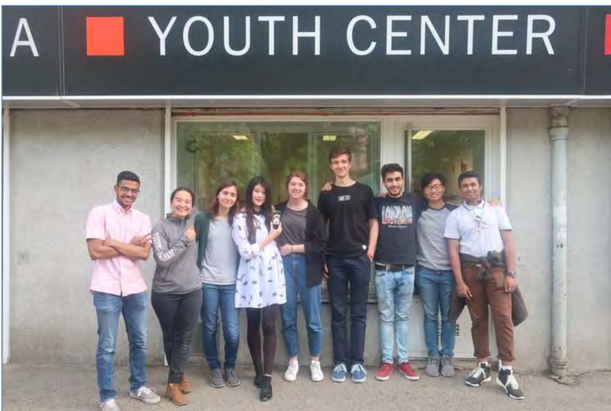
Finally, with all of CIGYM concluding their time in their countries, the Czech Republic team prepares for their final events, of hosting a two-day workshop, as well as leaving their final marks towards CARP, still continuing to build relations with the many students and young people coming to the youth center and delving deeper into universal principle studies.