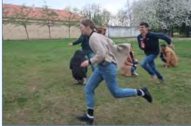
On April 18th to the 22nd, CARP hosted their five day Divine Principle retreat workshop! With participants coming from around Europe, such as Switzerland, Austria, Germany, and of course, Czech Republic, participants received lectures delving into various universal principles. The workshop also consisted of sports, team bonding, visiting various areas of Prague, and sharing deeply with one another.