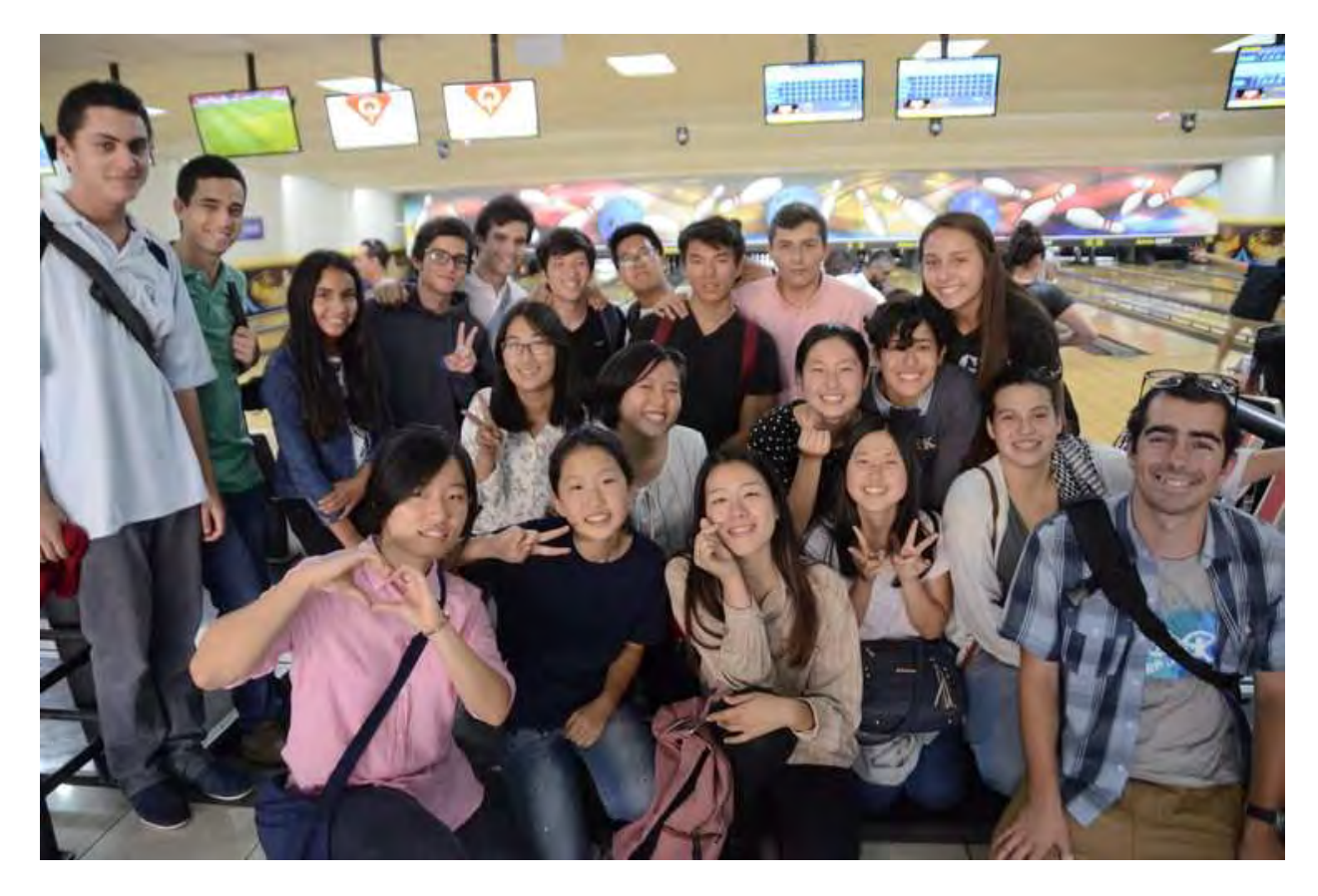
Finally we ended the week with a team meeting over a nice Argentine dinner. It was a chance for us to share our experiences and make determinations for the coming week. Sometimes this CIG program can be exhausting, but at the end of the day it's always worth it. See you next week!