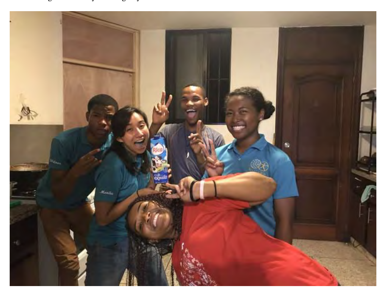
The kitchen crew having fun with one another!