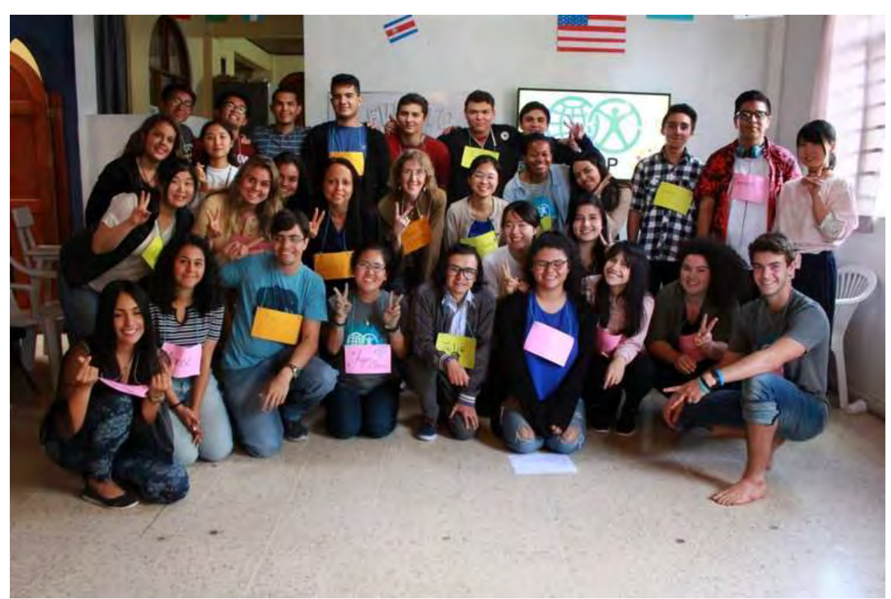
Our American Melting Pot event!! the first of many more to come :)

On Saturday February 17 - 18, CARP Costa Rica hosted its second 1-Day Divine Principle Workshop in the month of February. We covered from the Introduction up to the end of the Fall of Man. At the end of the workshop we offered a song to the guests and then gave them the opportunity to sign up to become official members of CARP. In Concluding the Workshop we had two new official members of our CARP Costa Rica Family, One being brought by our very own American Missionary team!