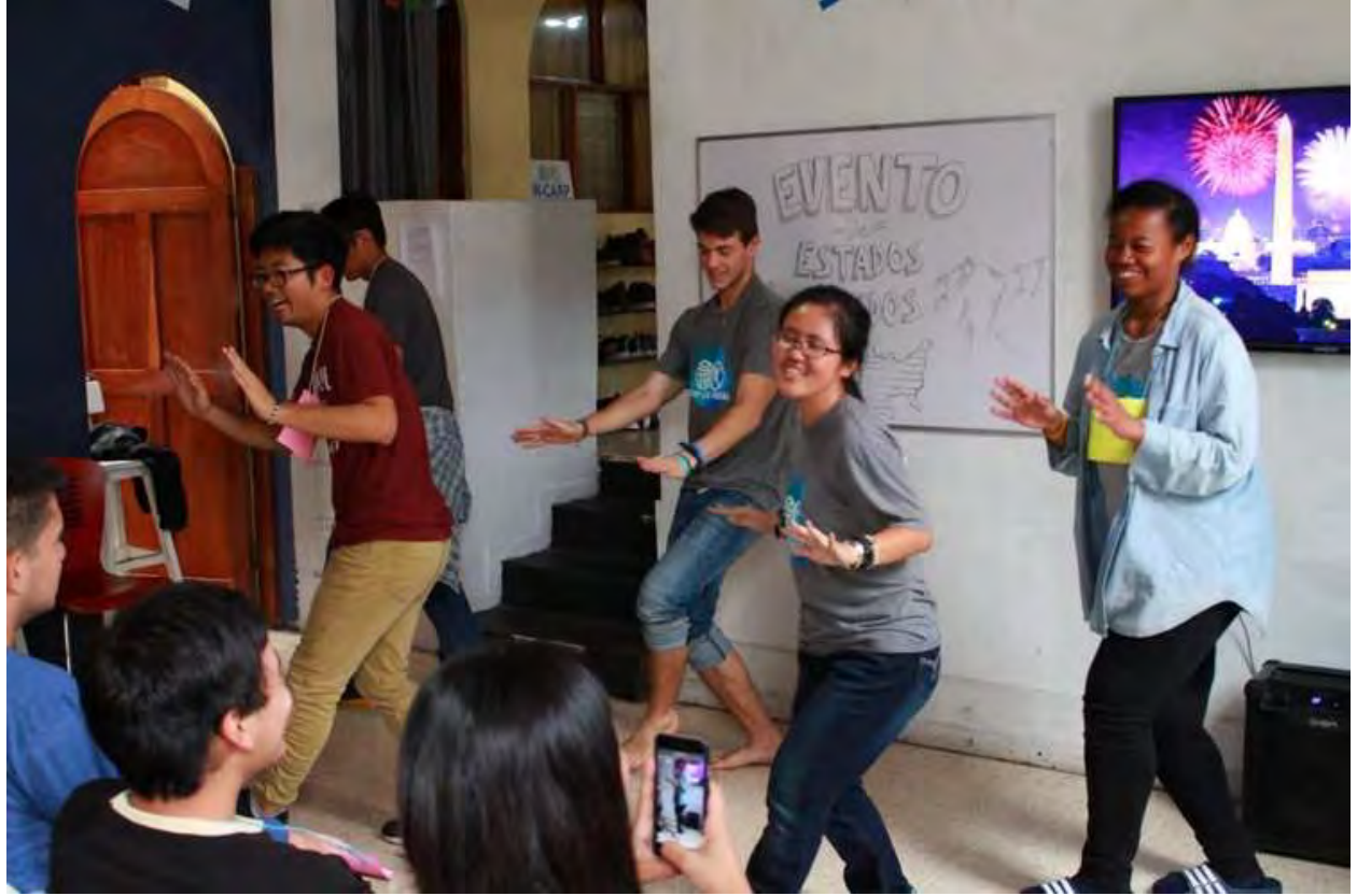
Performing our dance for our Guests at the Melting Pot event!!

¡Hola! It's your American CIG family in Costa Rica! It has been an incredibly busy week as we prepared, organized, and held our first American culture event in Costa Rica! We were also able to achieve victory when we were able to invite and bring one of our witnessing contacts to a 1-Day Divine Principle Workshop and become our first guest to become an official CARP member! They were both the first of many more to come, more events and many more young and inspired youth wanting to make a change!