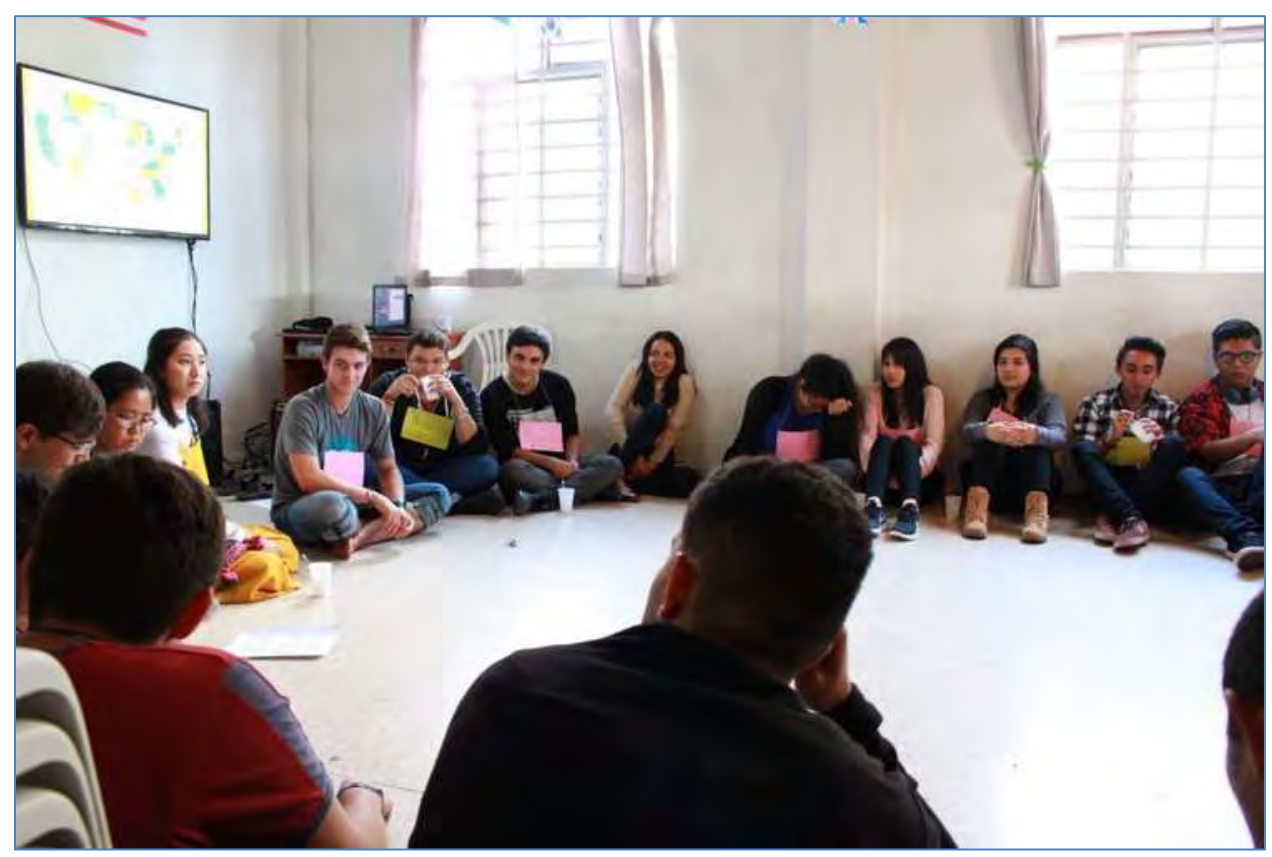
Each person shared about their experience and gratitude toward the event that we held!

that America is a country that transcends race and nationality, we can help others understand that we are one global family.