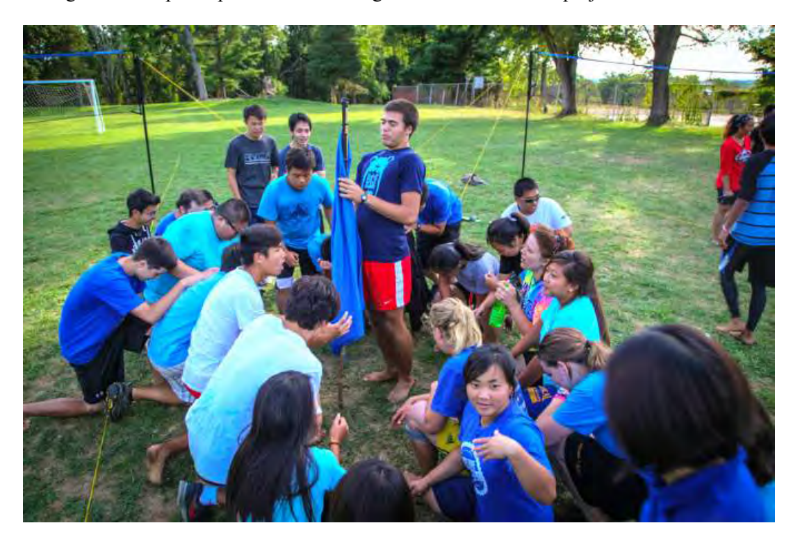
Yes it's true, the year kicked off just a few days ago, but GPA is already coming together as a family of brothers and sisters ready for an amazing year ahead. Feel called to help make that happen? Make a donation, and keep up with their photos and blog posts. You can expect great things to come!