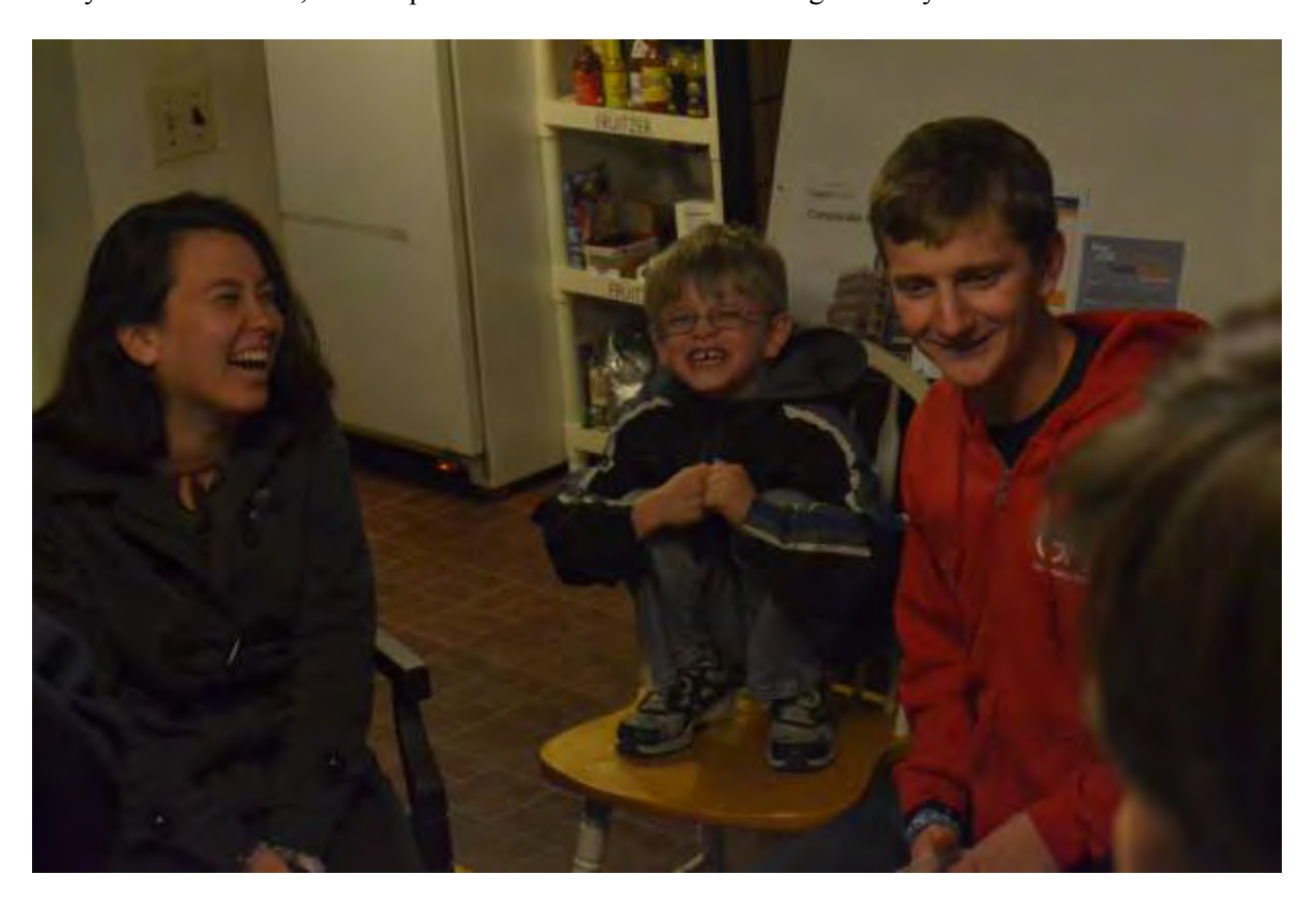
The Manchester Files – Tuesday, April 29, 2014 May 1, 2014

We then spent the night hanging out with the kids that come to the Faith Fusion church every Sunday. We wrestled, played charades and watched Rio 2 – which gets my recommendation by the way. The kids were really enthusiastic and bright and we loved playing with them. But what stuck out to me was just how much influence we had on them in everything that we did around and with them. We had the power to shape, in some small way, the way they saw the world and themselves. Maybe we cannot influence every kid in the world, but I hope that we left those kids a feeling that they are cared for and loved.